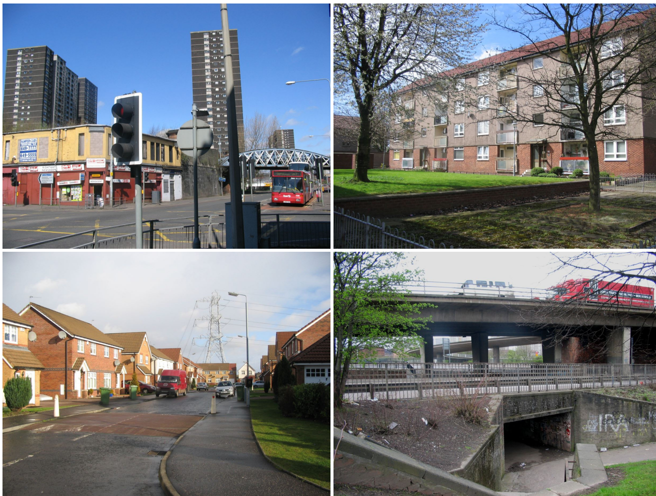
Figure 2 Examples of scenes in and around the local study areas. All images © David Ogilvie.

calculated the estimated total physical activity energy expenditure for each respondent (MET-min/week) and used a combination of frequency, duration and total energy expenditure to assign each respondent to a 'high', 'moderate' or 'low' category of overall physical activity in accordance with the prescribed IPAQ algorithm. The 'high' category corresponds to a sufficient level of physical activity to meet current public health recommendations for adults [20].