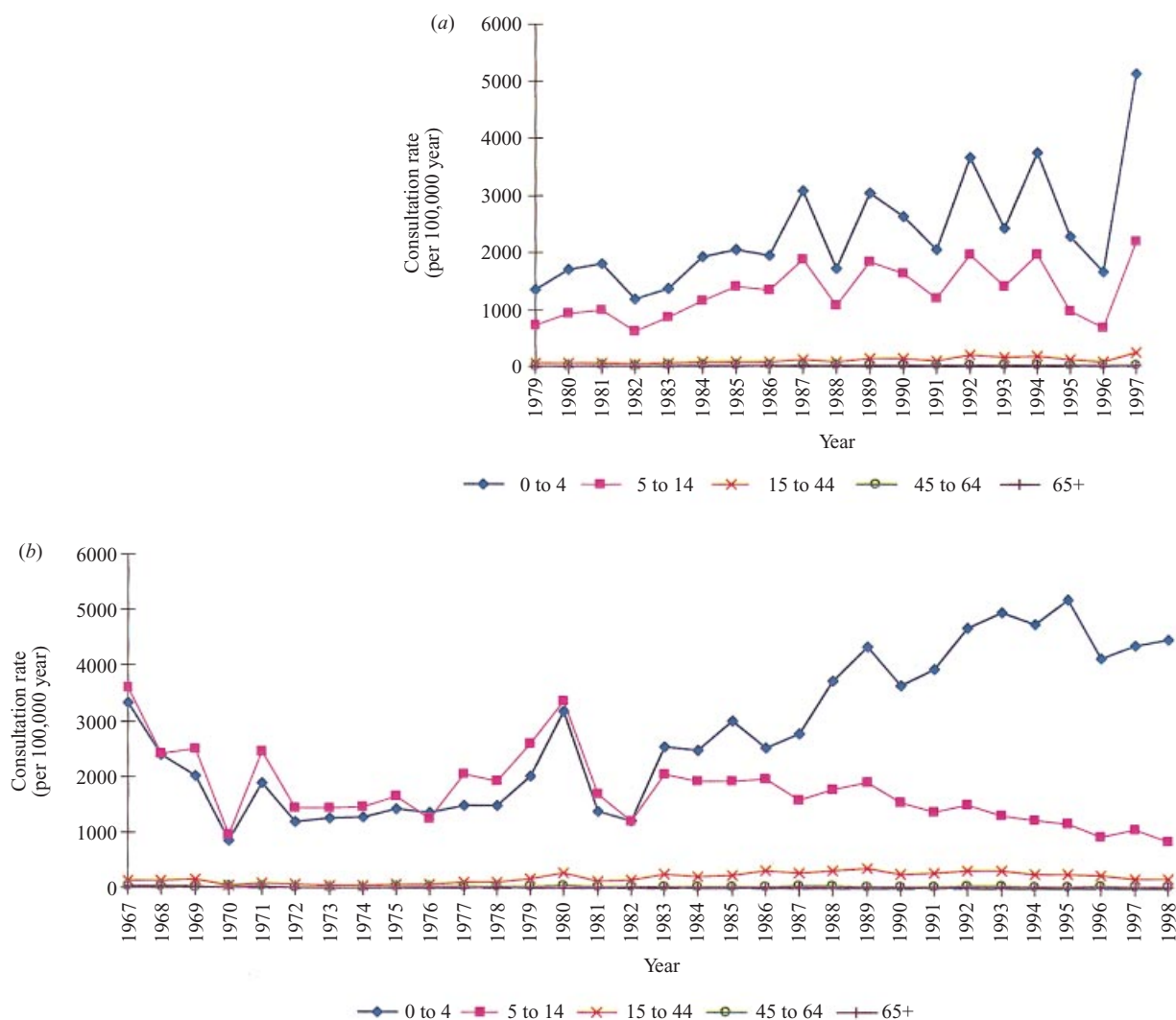
Fig. 1. Annual varicella consultation rate. Annual age-specific varicella consultation rate in (a) Manitoba from 1979–97, and (b) England and Wales from 1967–98. The X-axes in the main panels are aligned.

infections per susceptible-year, compared to 0.05 in Canada. Conversely among children of 5–11 years, there was an estimated 0.20 infections per susceptible-year, compared to 0.15 in the United Kingdom.