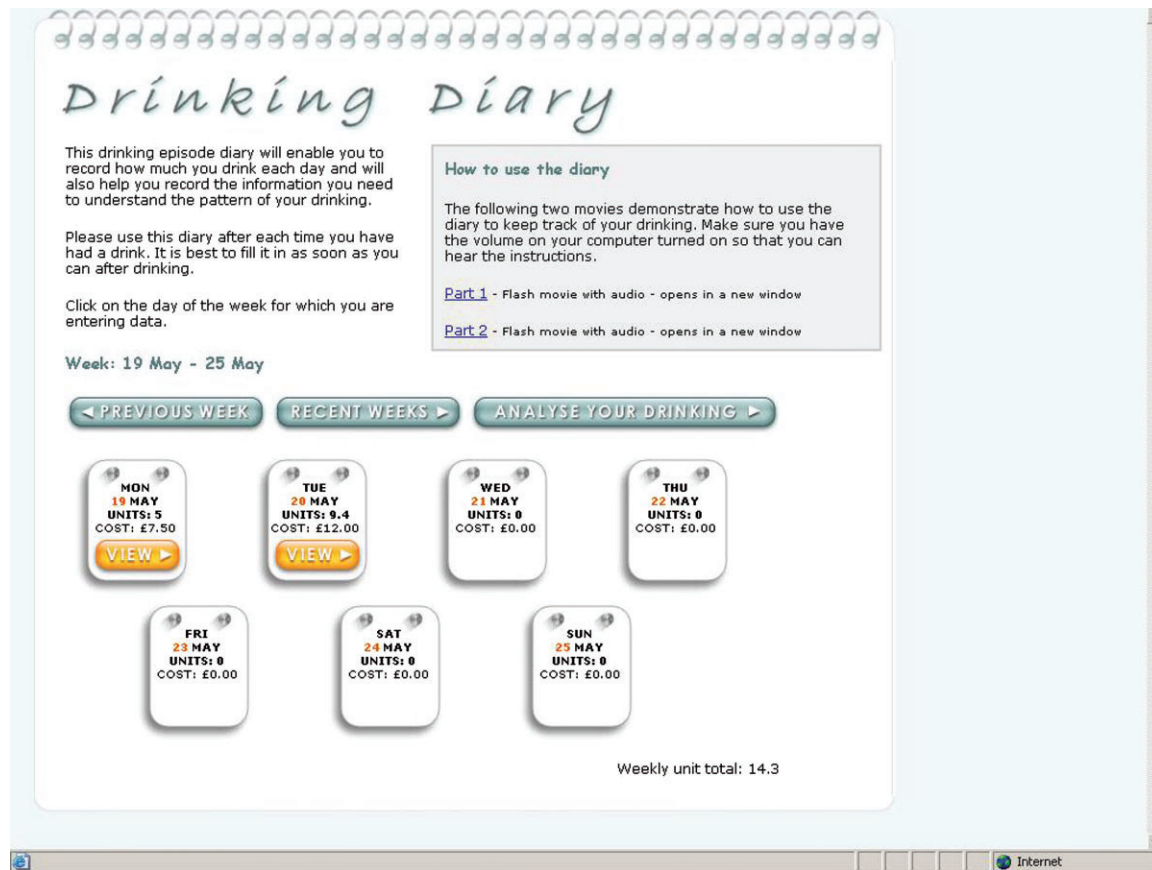
Fig. 2. Drinking episode diary.

programme). These emails can be turned on or off by the user at any point.