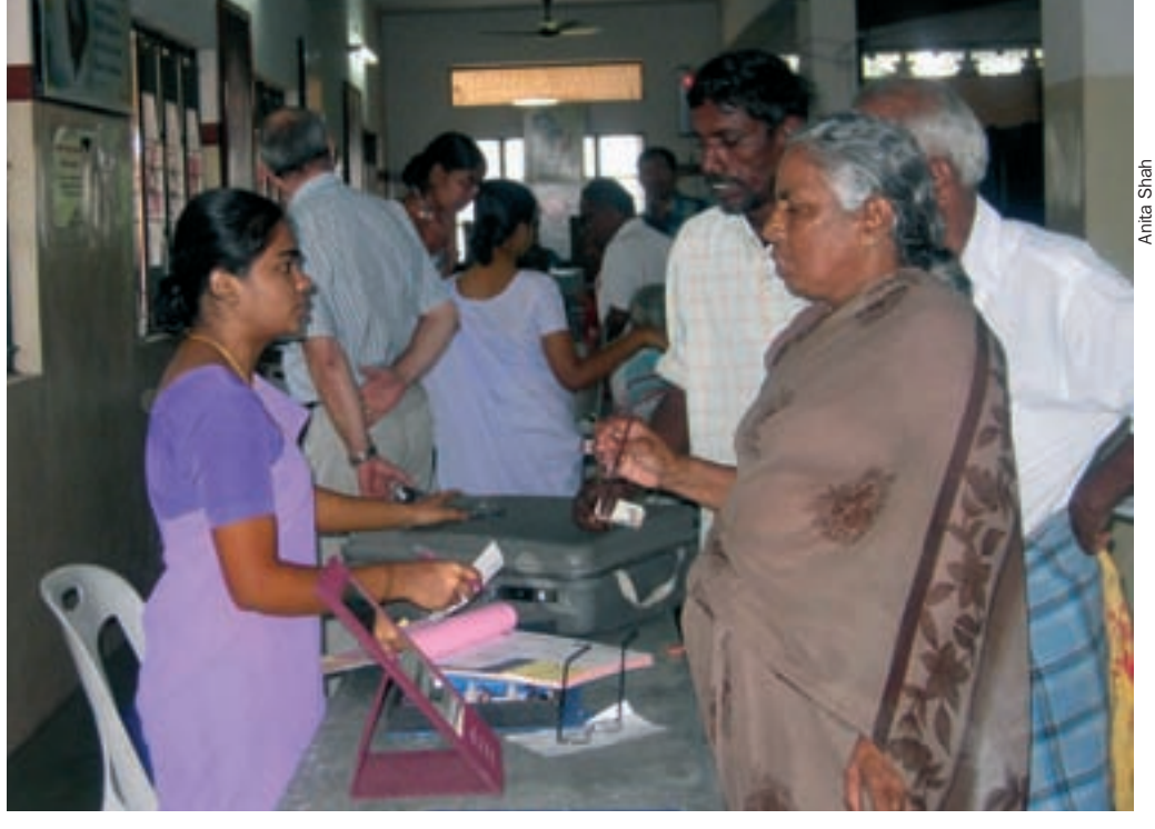
A patient collects her spectacles. INDIA

excluded correctable refractive error, which was therefore not recorded in surveys. Since then, some population-based blindness surveys have included people who cannot see because they have no spectacles and specific surveys have been done to assess refractive error in school children. Figures published in 2008 indicate that, due to uncorrected refractive error, there are 145 million people with VA ranging from < 6/18 to 3/60 and 8 million people who are blind (VA < 3/60) (see Table 1).<sup>3</sup> Spectacles have generally become more available and more affordable, but in many countries there is still a need for good refraction services and for appropriate dispensing of low-cost but good-quality spectacles.