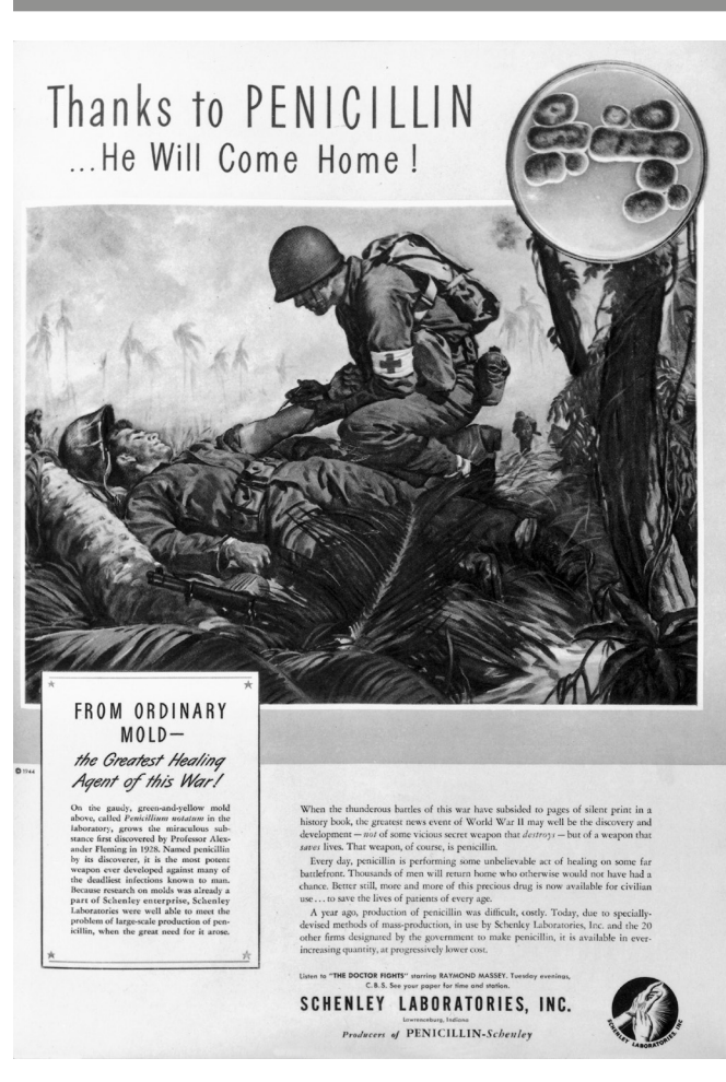
Figure 1 Advertisement for penicillin production from Life Magazine.

(Amyes 2003). Our antibiotic weapons were central to founding our modern medicine, agriculture and military (Bud 1998; Kirchhelle 2020; Podolsky et al. 2015; Bud 2011; Landas 2020), and modernisation of our very form of life through helping us: shift our hygiene practices in hospitals and farms (Gradmann 2018); increase our-demands for-efficiency, speed and scale of animal production and medical practices (Kirchhelle 2020; Bud 2006); empower our (im)patients, freeing us from illness and dispelling our dis-ease (Bud 2007a); reduce our need and calls for convalesce (Macfarlane and Worboys 2008); increase modern pharmaceuticals' and other industries' profits (Podolsky 2014; Quinn 2013) and ensure we emerged victorious in our