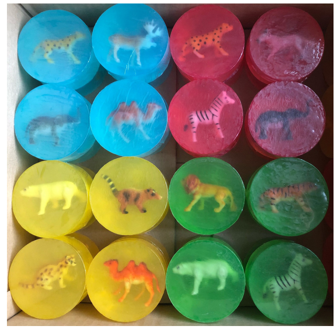
Figure 1 Surprise Soap image.

Soap bars to the children, explaining that the more often they wash their hands with the soap, the faster they will reach the toy inside, and listing five key handwashing times (before eating, before preparing food, before serving food to another person, after using the toilet and before cleaning another person's faeces). The hygiene promoter then demonstrates the ideal handwashing technique, inviting the children to practice washing the glitter from their hands using the Surprise Soap, and then finally leaving a parcel of five Surprise Soaps with the children in the household (parcel directly handed to a child). At least one adult, usually a caregiver, was present during intervention delivery but they were not personally instructed on the use of these toy soaps. On the same day, directly after the 4weeks, 12 weeks and 16 weeks follow-up household observations, the hygiene promoters visited the households again to distribute further packages of Surprise Soap but did not repeat the household session. Soap packages all contained soaps with different toy animals so that the children did not receive the same toy twice over the intervention period. No handwashing messages were delivered during these follow-up visits.