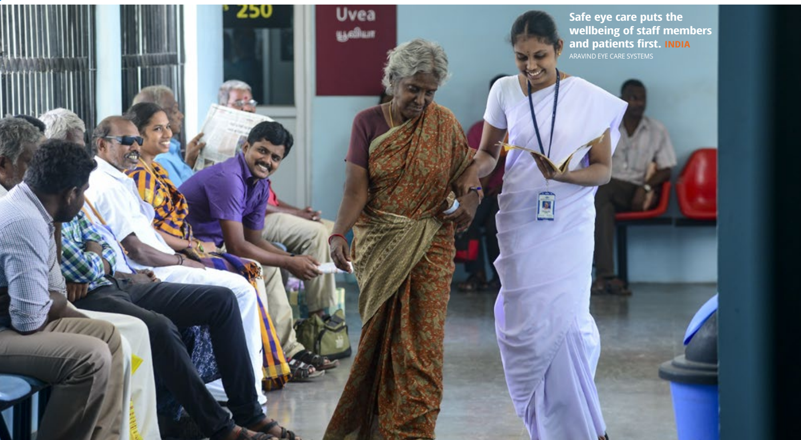
Safe eye care puts the wellbeing of staff members and patients first. INDIA ARAVIND EYE CARE SYSTEMS