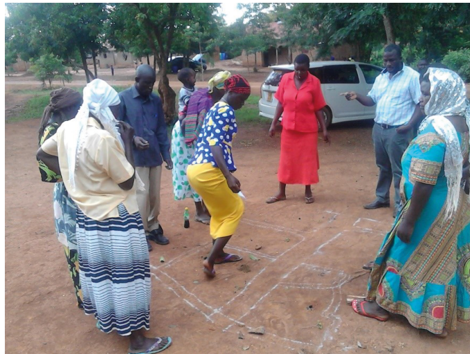
Fig. 1. A group of community led total sanitation participants drawing village map.

the prevalence survey. It is an important step to make a correct diagnosis of NTDs in order to treat and prevent them appropriately. In this perspective, laboratory personnel in Mayuge district were taught how to make slides by using the Kato-Katz method (Fig. 3) and also learned how to read the slides by using microscopes by Korean parasitology professors who participated in the prevalence survey.