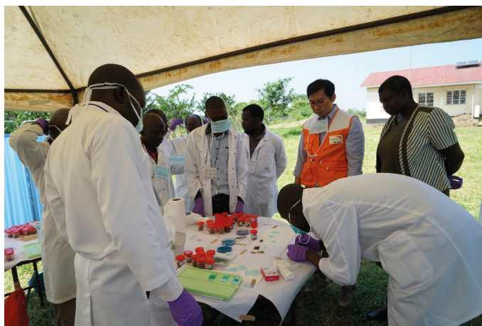
Fig. 3. Training laboratory personnel for making slides by using the Kato-Katz method.

such as school-based education activities, emphasizing how to reduce the risk for SCH and STH transmission. We also identified that hookworm is the most common STH in Mayuge district, which need skin protection to reduce its transmission.