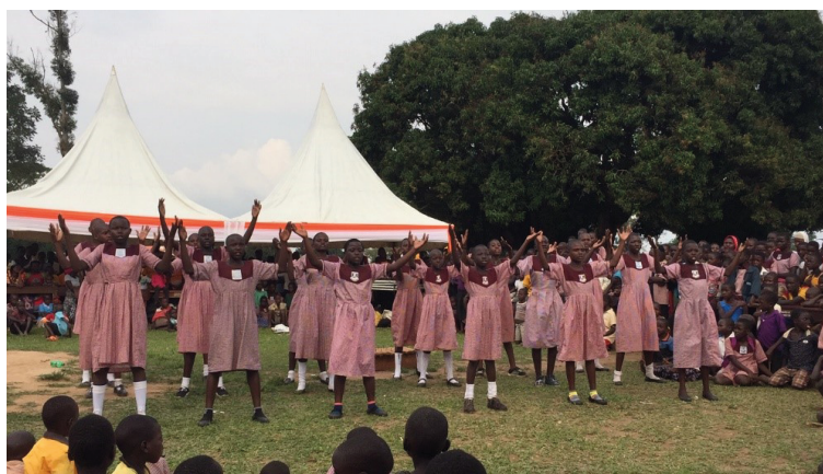
Fig. 4. School contest for increasing awareness of neglected tropical diseases prevention.

Although elimination of NTDs is complex, yet many elimination projects utilize a simplistic approach, such as MDA alone, which is incomplete and lacks efficacy. It is important to acknowledge that NTDs are a persistent problem and risk increases as exposure increases. The long-term goal should be to reduce the conditions of poverty which allow for pathogenic organisms to enter into the lives of millions of people in Uganda and across the world. The elimination of NTDs can only be achieved slowly and steadily as we remove potential threats