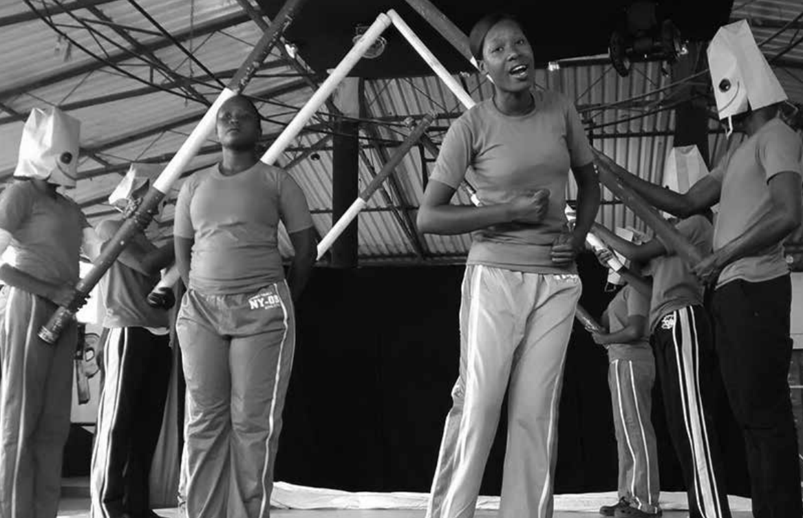
Left: Street theatre project in the Dominican Republic.

that ‘as we tell stories about the lives of others, we learn how to imagine what another creature might feel in response to various events. At the same time, we identify with the other creature and learn something about ourselves.’ 3 By presenting to the audiences the plight of minority and indigenous communities through stories about the lived experiences of individuals, the project enabled them to understand these ‘other’ communities as groups of people much like themselves. The audiences were able to empathize with the individual and to gain an understanding of what it would be like to face the struggles of that community. It is this empathetic response that art can generate which fosters attitudinal change.