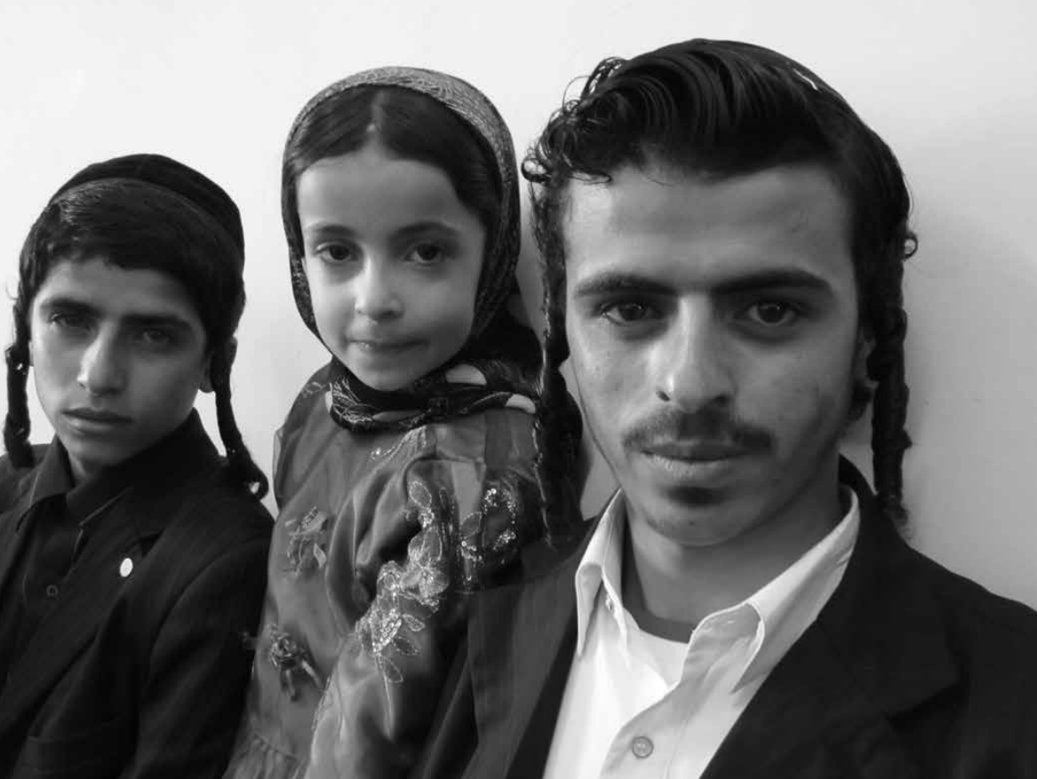
Left: Yemeni Jews.