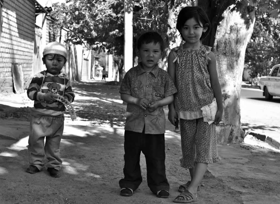
Left: Uzbek children in Kyrgyzstan.

and 2015. At the same time, Osh's Uzbeks are increasingly embracing Kyrgyz majority markers in an attempt to avoid prejudice and expand their professional opportunities. For example, majority ethnic Uzbek schools are largely switching their language of instruction to Kyrgyz and Russian, and in 2014 the education ministry did away with the Uzbek-language university entrance exam, citing insufficient interest.