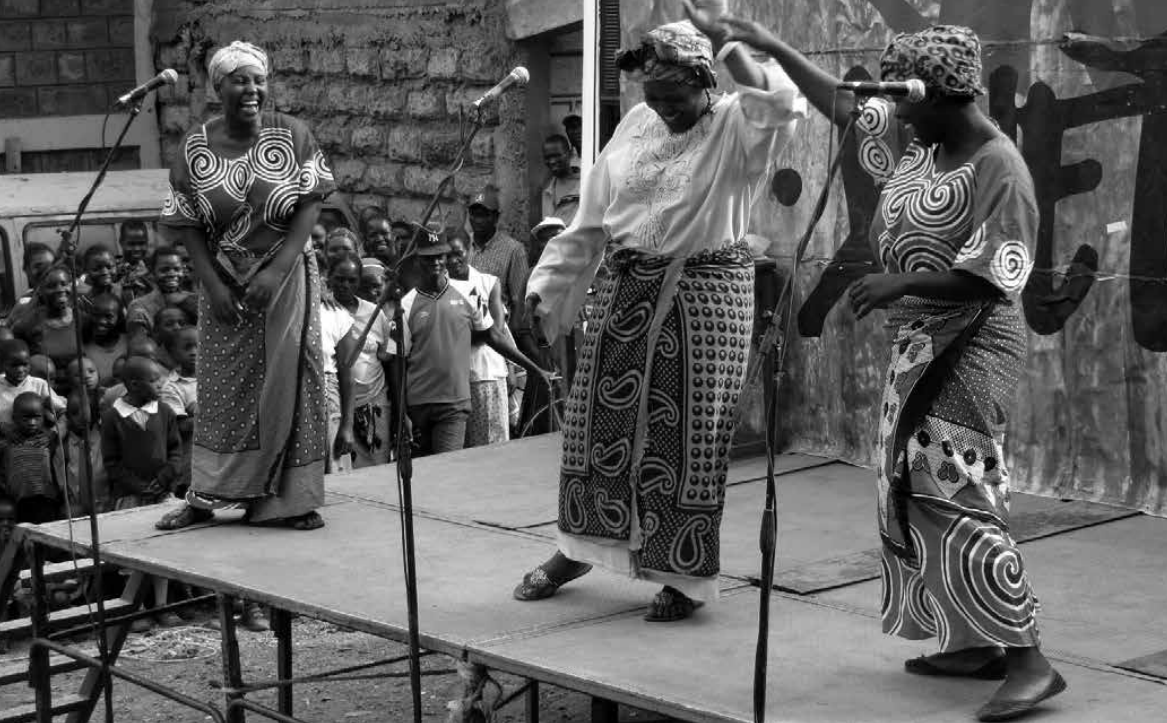
Left: Street theatre performance in Kenya. SAFE KENYA.

suggests that the performances had raised their consciousness of the issues and uncovered an openness to act, with numerous officials and leaders pledging support following performances: the vice-president of Botswana praised the way the performances championed diversity; a councillor promised to discuss the issue of discrimination in council; a chief in Rapostwe, Botswana, said he would encourage village chiefs to consider the issue; and a pastor pledged to dedicate a day in church to discuss it. While there were insufficient resources for significant follow-up, the feedback points to the considerable potential that a sustained effort may have in transforming attitudes.