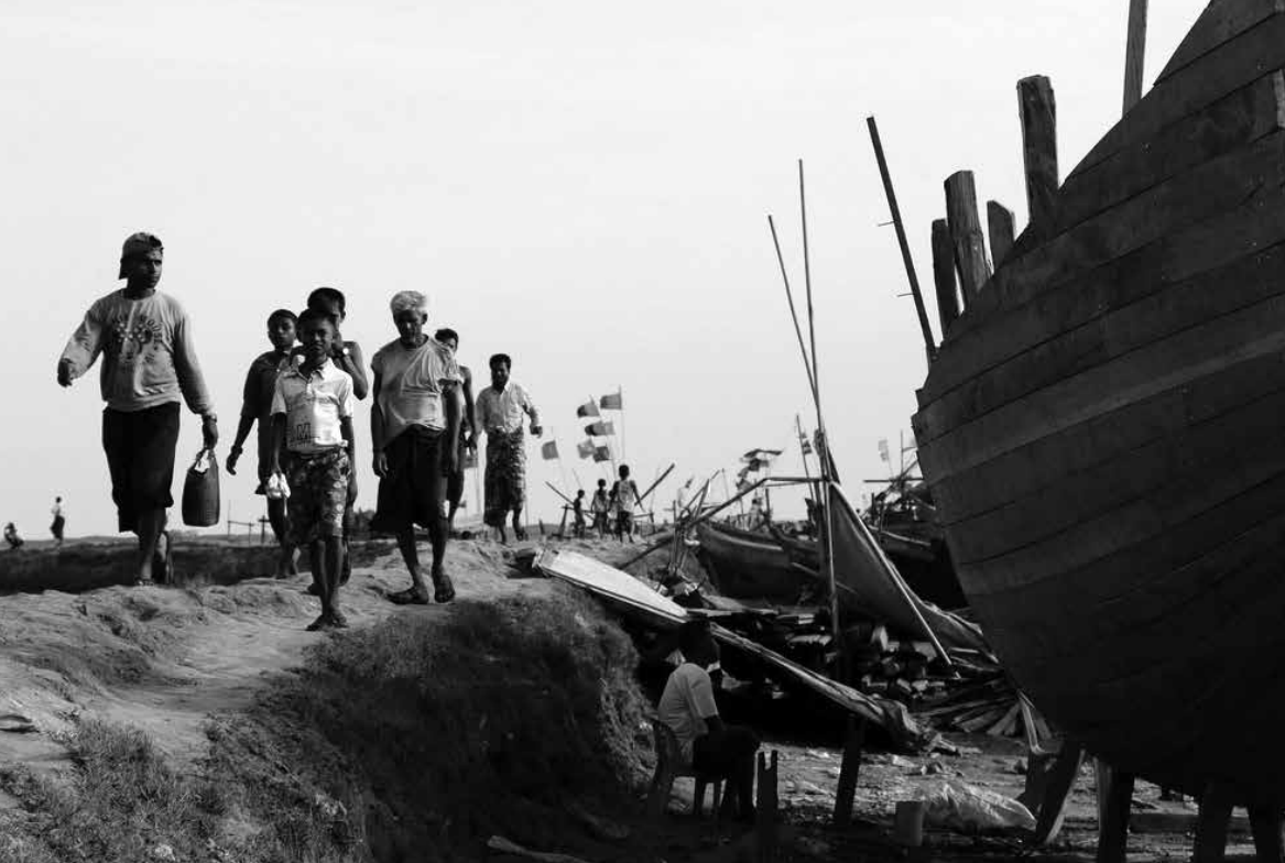
Left: Rohingya in Burma.

junta in 1989. The government presented the decision to change the country's official name from 'Burma' to 'Myanmar' the same year as an effort to dismantle the last vestiges of colonialism – since the former was used by the British. However, it also led to the deliberate erasure of ethnic minority heritage and languages as many names were 'Burmanized' and subsequently lost their original meaning. This policy of sidelining minority cultural expressions persists to this day, as reflected in February 2016 when authorities refused to allow Karen and Chin cultural groups to celebrate their national days in Yangon. And on the rare occasions the government has sought to showcase its diversity, its representation is carefully choreographed: for example, at the 2014 ASEAN Summit in Naypyidaw, when ethnic Burmans donned indigenous outfits to welcome delegates at the start of the event.