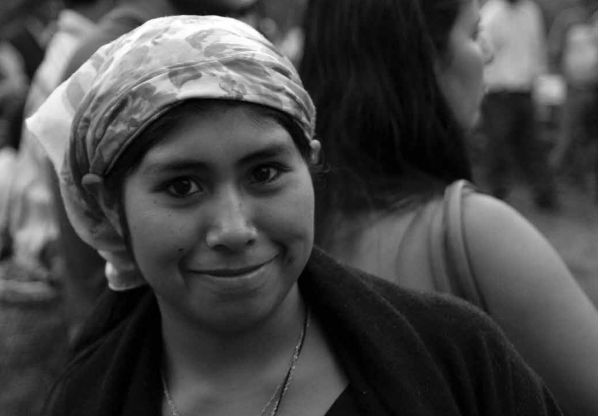
Left: Mapuche woman in Chile. Alessandro Caproni.

(floating gardens) and the Inca waru-waru water distribution system – are still in use in parts of Bolivia, Mexico and Peru. Traditional knowledges also inform the complex systems that sustain Saami reindeer in the Arctic, Maasai cattle in Kenya, yaks in Tibet and many other pastoralist herds worldwide, as well as the underground systems ( qanat ) of Central Asia and oasis-based cultivation in arid regions of North Africa and the Sahara. 13