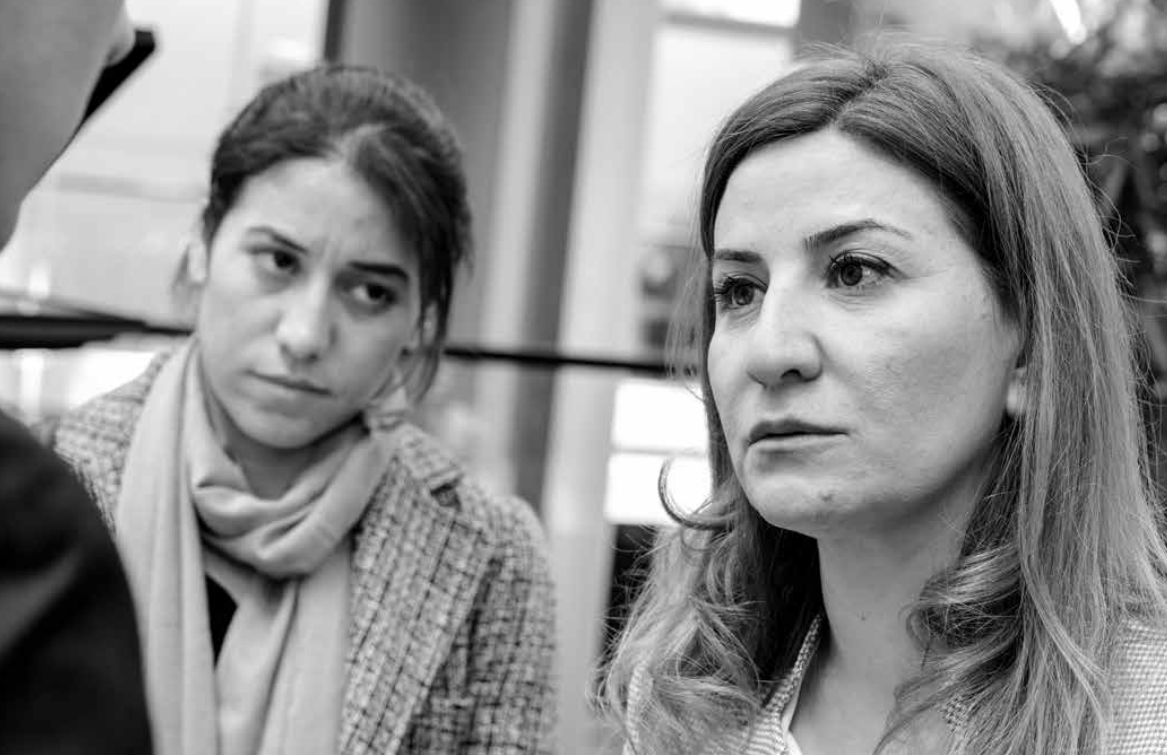
Left: Representatives of the Yezidis in Iraq make a plea for support during a meeting with European Parliament President Martin Schulz in April 2015.

Another devastating aspect of the conflict for minorities has been the systematic destruction of symbols of their cultural, intellectual and religious heritage, part of the ISIS strategy to eliminate all remnants of diversity in the areas they control. Since the group's takeover of Mosul in 2014, it has destroyed innumerable churches, mosques, shrines, graves and other religious and cultural sites. Throughout 2015, reports continued to emerge of the group looting and destroying mosques and churches in Mosul, in addition to numerous Kaka'i, Shabak and Yezidi shrines in Sinjar and the Ninewa Plains. After destroying an estimated 90 artefacts from Mosul Museum in February, most of them linked to the Assyrian civilization, in March the group sparked international outrage and condemnation from the UN when it proceeded to destroy the ancient city of Hatra and the historical Assyrian capital of Nimrud. On 15 July, the group reportedly ordered staff at the University of Mosul to burn more than a thousand Master's and PhD dissertations authored by Christian, Shabak and Yezidi students.