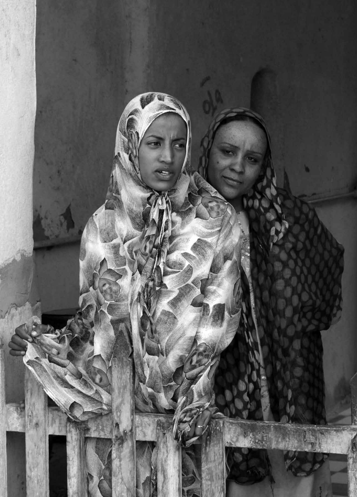
Left: Nubian women in Egypt. Katie Hunt.

for the fact that this once sizeable religious community, comprising as many as 80,000 in the late 1940s, now reportedly numbers only seven people, the majority elderly women.