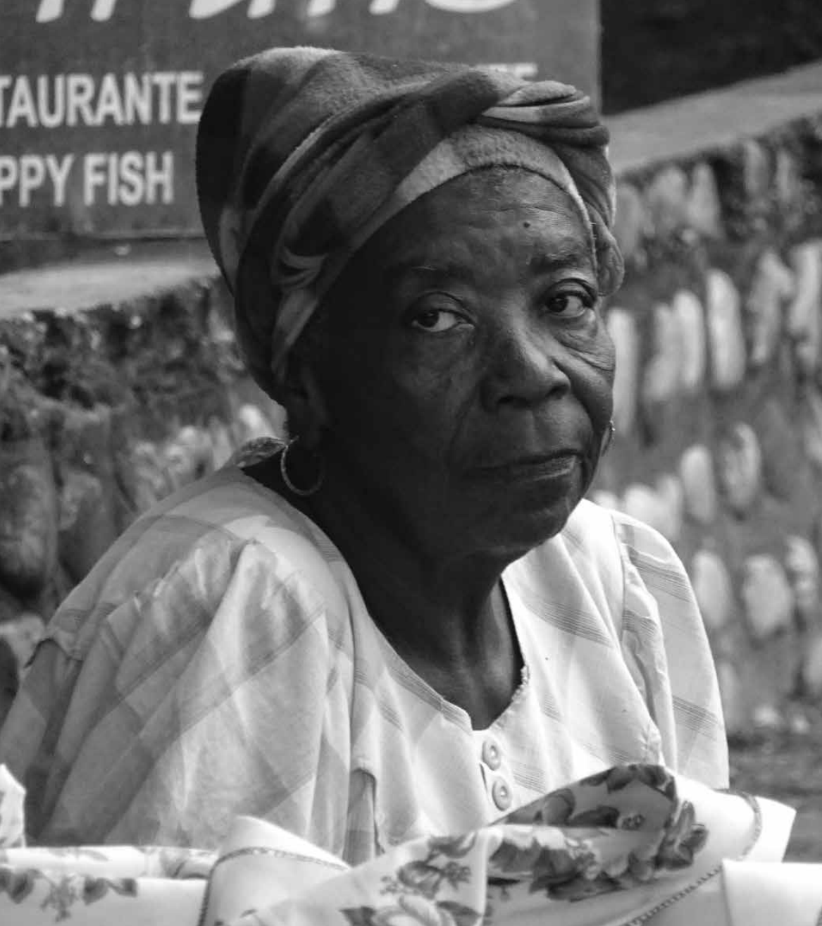
Left: Garifuna woman in Guatemala.

pervasive. In 2015, the Observatory of the human rights organization UDEFEGUA reported 493 attacks against human rights defenders, 252 of whom were activists or leaders defending indigenous rights and the environment. Much of this violence is related to the development of energy and extractive projects on indigenous or Garifuna land. While public institutions often side with corporations and private investors by criminalizing protesters, violence and intimidation against communities frequently goes unpunished.