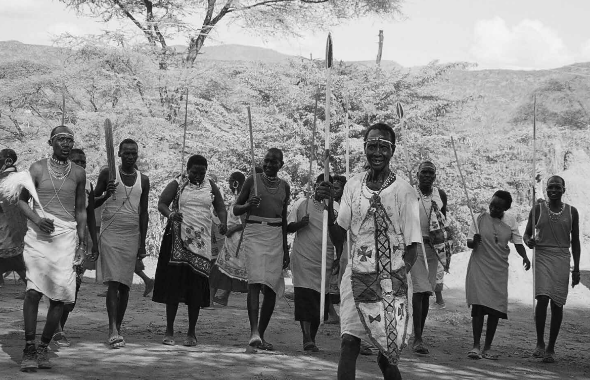
Left: Members of the Endorois community in Kenya perform a dance. MRG.

their claims. These included recognition of their ownership of their land, restitution of their land and compensation. In September 2014, the government established a Task Force to develop a plan for implementation of the Commission's decision. However, the Task Force's terms of reference limited its mandate purely to investigating whether implementation was possible, rather than how to implement the decision; the Endorois were not part of the Task Force and its terms of reference did not require consultation with the community. The Task Force made no meaningful progress during its 12 months of operation, and, to date, its mandate has not been extended.