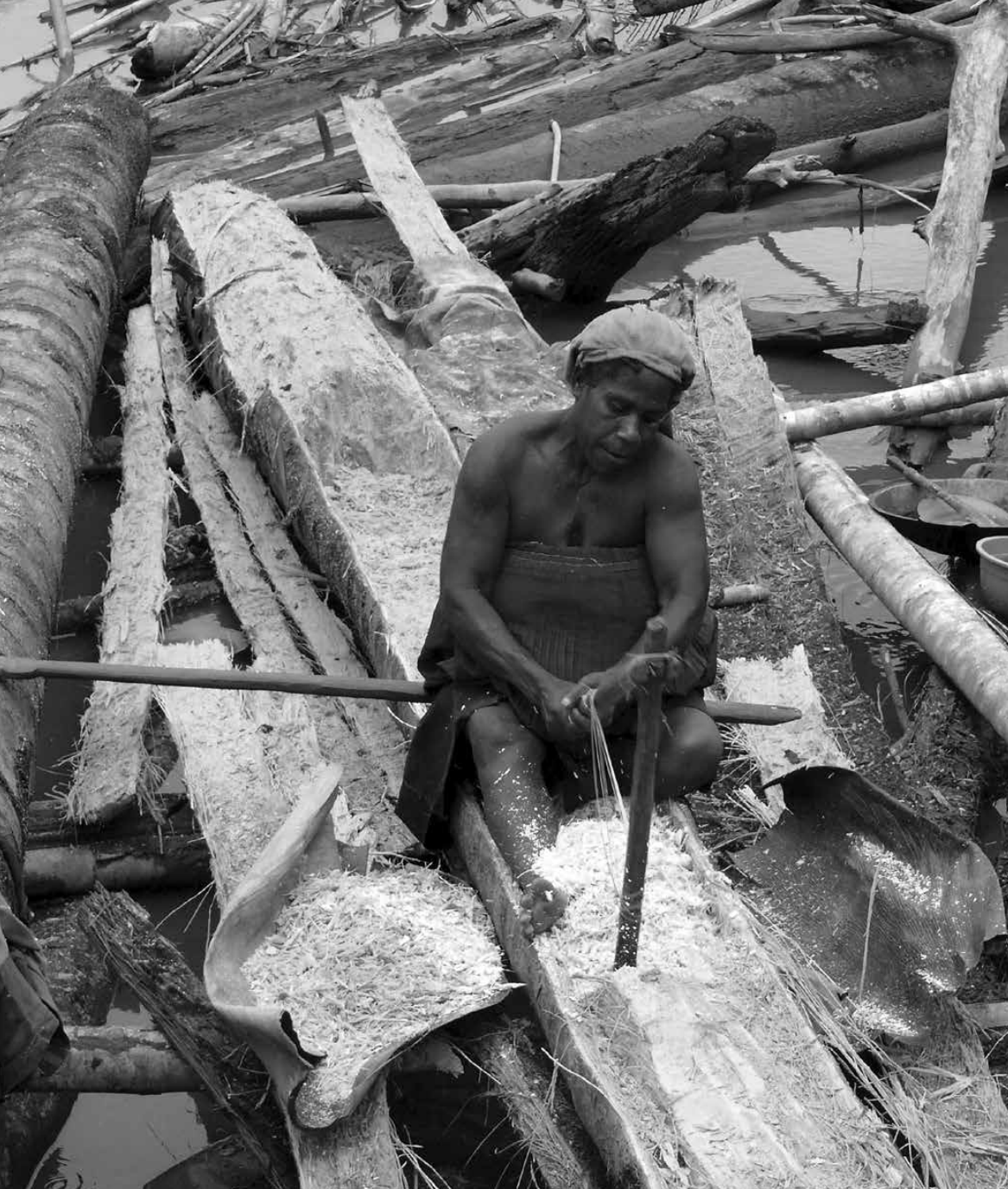
Left: An indigenous Papuan woman makes sago (an edible starch) in Papua, Indonesia.

killings and harassment of peaceful human rights activists have continued, despite Jokowi's public commitment to improving the lives of indigenous Papuans.