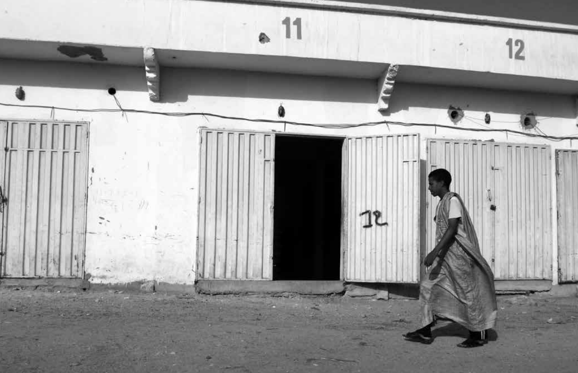
Left: Haratin man in Mauritania.

is particularly prone to inter-communal clashes, with 2015 being no exception: in April, for example, at least 23 people were killed by suspected armed Fulani herdsmen as a result of a protracted feud between herders and local farmers. As they are not considered 'native', despite many having been in the area for decades, Fulani receive inferior treatment under local legislation.