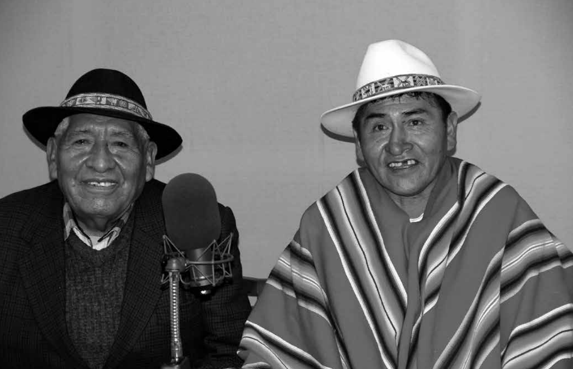
Left: Kallaway traditional healers give a talk at the United States Embassy in Bolivia. Embajada de Estados Unidos en Bolivia.

minority legal processes – which often draw on spiritual tenets – not only violates cultural rights, but also undermines the right to practise religion.