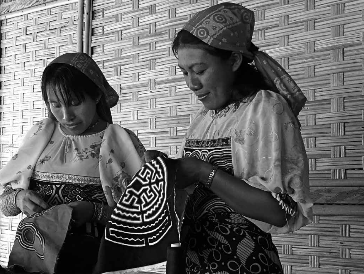
Left: Kuna women sew molas in Panama. Rita Willaert.

between issues of intellectual property rights and the economic needs of Kuna women.