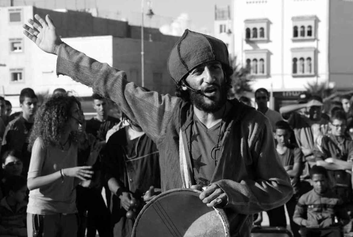
Left: Street theatre performance in Morocco.

demonstrates the social and political power of the arts, as well as their considerable potential for organizations like MRG to communicate messages, mobilize communities and transform social attitudes towards minorities and indigenous peoples. As the organization has found, this is by no means an easy task and the process of attitudinal change can be protracted. Nevertheless, despite some salutary lessons along the way, the results have been very encouraging. MRG is currently exploring other ideas and actively developing projects in new locations. Ultimately, building on what it has learnt over the last few years, MRG is hoping to broaden its repertoire of cultural forms, as well as to use new vehicles such as radio plays and fiction films, to reach new types of audiences.