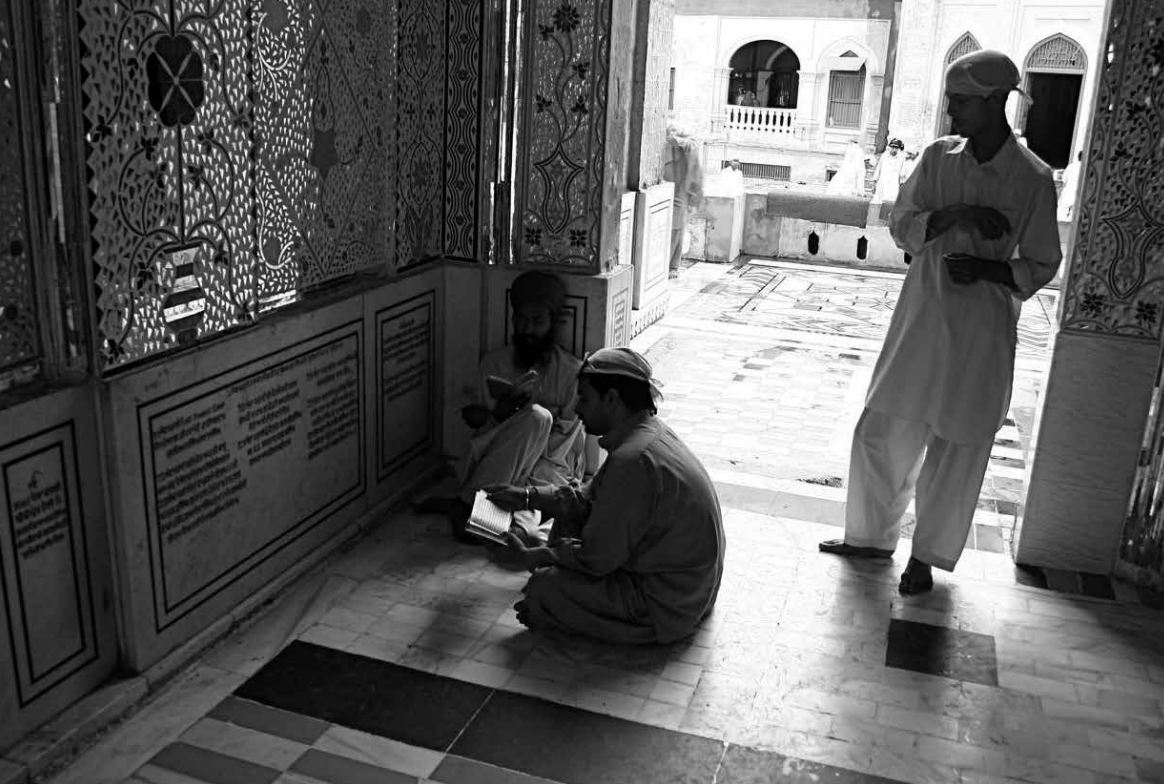
Left: Members of Pakistan's Sikh minority pray at a temple in Hassanabdal.

opposition UNP secured 106 seats of the 225 available and its leader Ranil Wickremasinge, together with Sirisena, formed a 'national unity' government. In a significant and reconciliatory move, the new parliament appointed Rajavarthiam Sampanthan, leader of the Tamil Nationalist Alliance (TNA) – considered the political proxy of the Tamil Tigers during Sri Lanka's armed conflict – as opposition leader. Other immediate measures taken by the Sirisena government to win the confidence of minorities included appointing the country's first Tamil chief justice and removing a controversial Sinhalese former military official from the post of governor of the Northern Province.