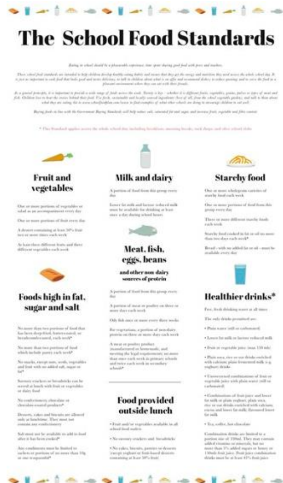
Figure 2 The School Food Standards in England

A summary of the standards and a practical guide are available at school food standards: resources for schools 18 . They set out a food-based approach “designed to make it easier for school cooks to create imaginative, flexible and nutritious menus”. They also include recommended portion sizes.