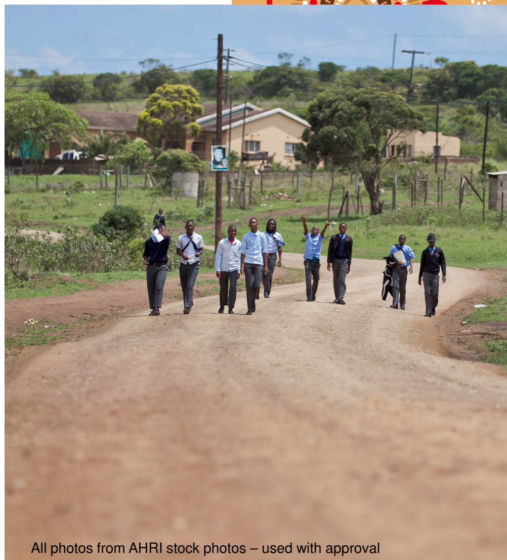
All photos from AHRI stock photos – used with approval