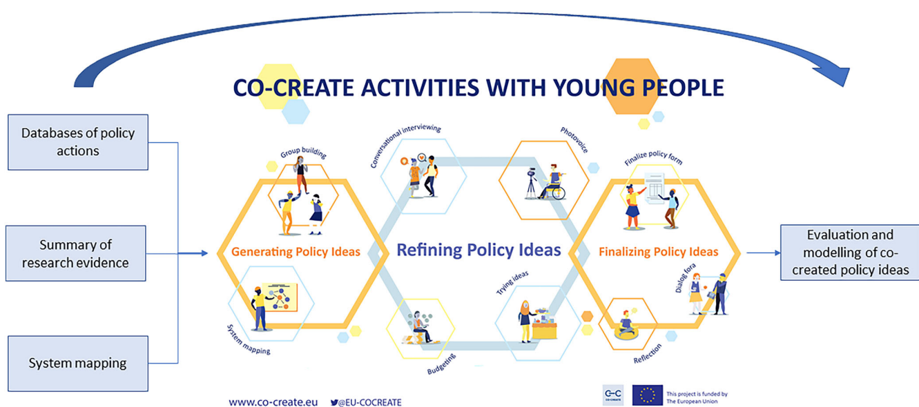
FIGURE 2 The overall flow of the CO-CREATE project and the relation between the two main objectives: Monitoring and youth engagement process

Ensuring that the novel aspects and findings of the CO-CREATE project are disseminated widely has been a key consideration