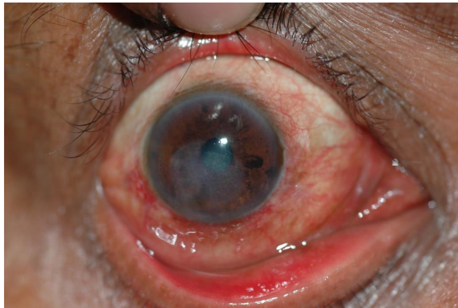
Figure 3. Corneal ulcer caused by Fusarium spp. at 3 months.