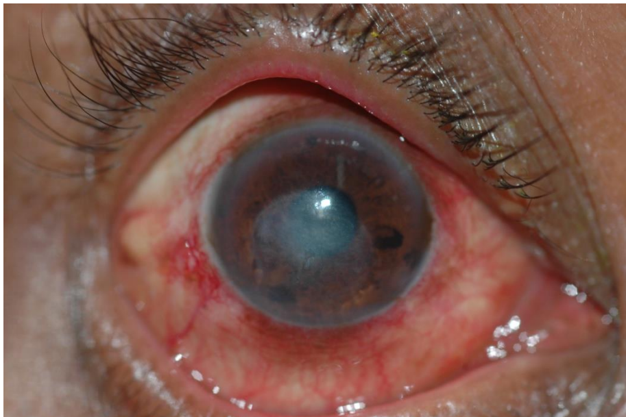
Figure 2. Corneal ulcer caused by Fusarium spp. 1 month later.