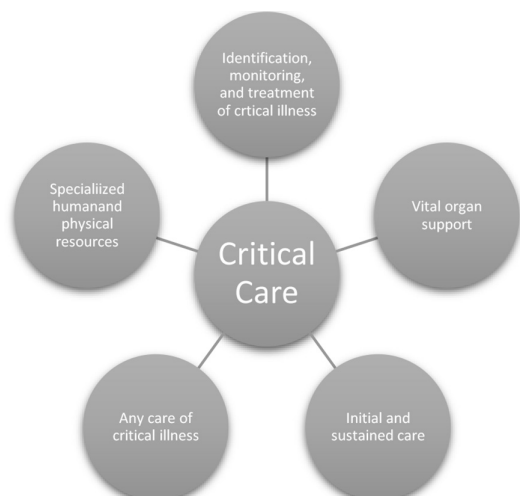
Figure 3 The defining attributes of critical care.

However, we found diverse and varied usage of the concept concerning the attribute of reversibility and the interface between critical illness and the natural process of dying. Some uses included only illness that