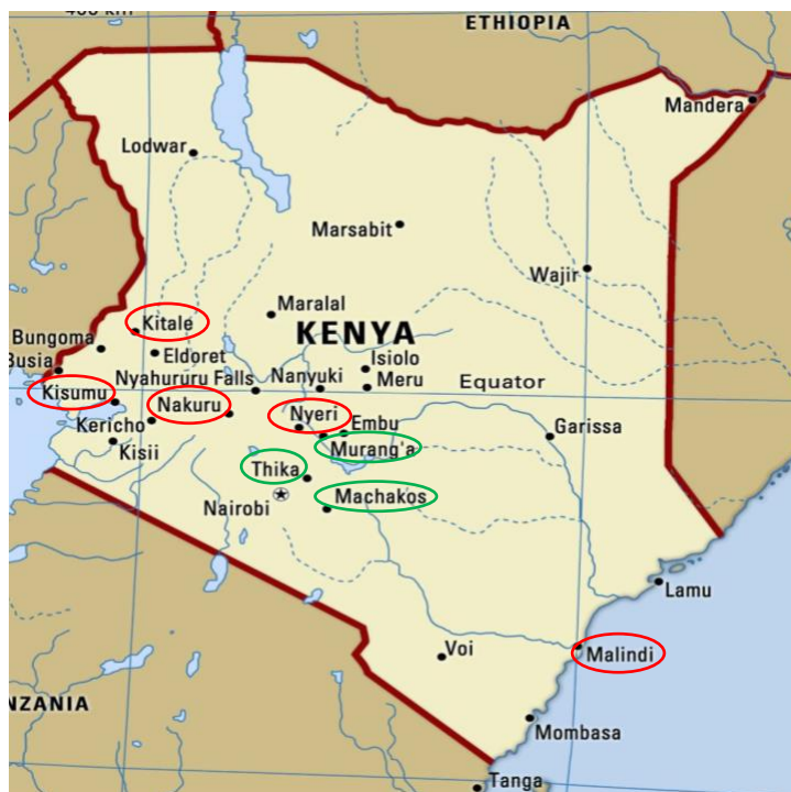
Figure 1: A Map of Kenya showing the AMR Surveillance sites