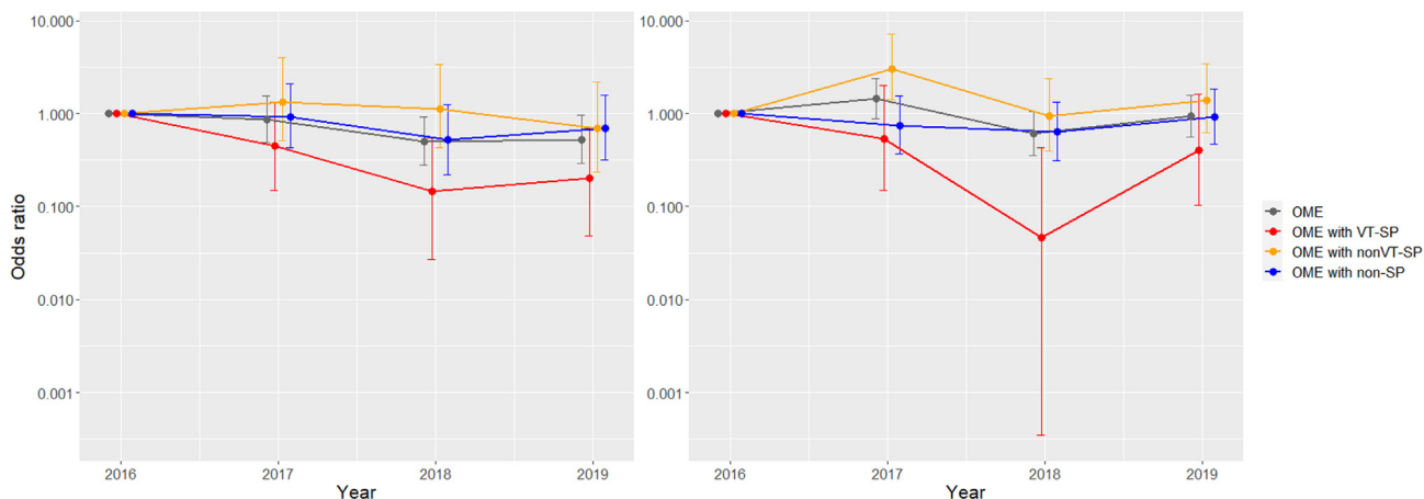
Fig. 2. Odds ratios (95% Confidence Intervals) for OME, OME with VT pneumococcal carriage in the nasopharynx, with non-VT pneumococcal carriage, and with no pneumococcal carriage in 2017, 2018 and 2019 compared to those in 2016 by age groups, presented on a log scale (left: <12 months, right: 12–23 months).