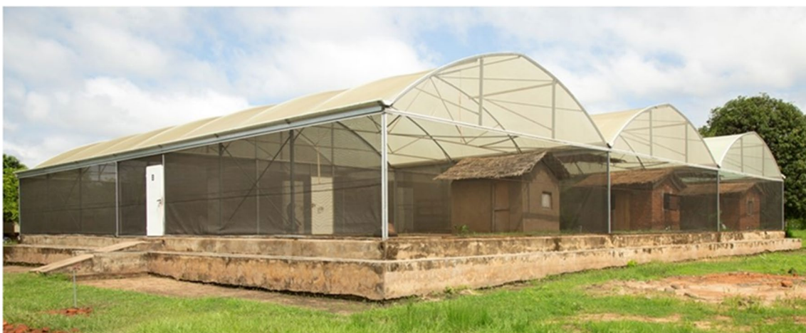
Fig. 2 Ifakara Health Institute Semi-field compartments located at the Mosquito City facility in Kining'ina village, with experimental huts in separate cages

Details of the experimental huts are shown in Fig. 3 and in the Additional file 1. In experiment 1, huts with light-permeable walls were compared with light-opaque walled huts. Importantly, the walls consisted of two layers, the external layer was shade cloth and the internal layer clear or opaque plastic. This design compared the effect of light alone, keeping the indoor temperature similar in both hut typologies. Each hut was constructed using 25.4 mm 2 iron-metal frames and measured 2.62 m \times 1.86 m in floor area, with 2.0 m high walls with 150 mm high eave gaps immediately under the over-hanging roof. In each hut, there was one metal door, 1.75 m high and 75 cm wide, with a 20 mm high by 750 mm wide slit above and below the door, to simulate a badly-fitting door common in villages. The roof was made of corrugated sheeting with a sloping flat design.