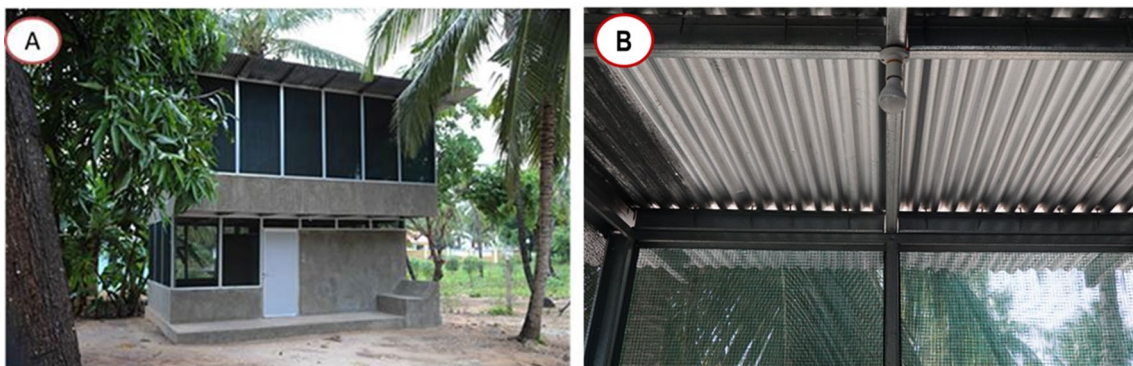
Fig. 1 Star home. A exterior view; B interior view showing the air-permeable green shade-net wall and the bright light above the purlins and below the corrugate iron roof showing the openings under the roof

The study was conducted at Mosquito City, Ifakara Health Institute’s semi-field system, located near Kining’ina village (8.11417 S, 36.67484 E), approximately 5 km north of Ifakara town, Tanzania, in the dry season,