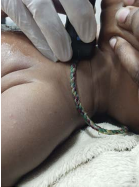
FIGURE 2 Example of suprasternal notch imaging in paediatric patient.

L'échographie thoracique est une alternative attrayante à la radiographie pulmonaire pour le diagnostic de la TB. En prenant appui sur l'expérience acquise lors d'études ayant utilisé l'échographie thoracique chez l'adulte et l'enfant en Afrique du Sud, trois considérations clés pour une éventuelle utilisation accrue de cet outil ont été identifiées. Premièrement, tout nouvel utilisateur d'un échographe thoracique doit suivre un programme de formation