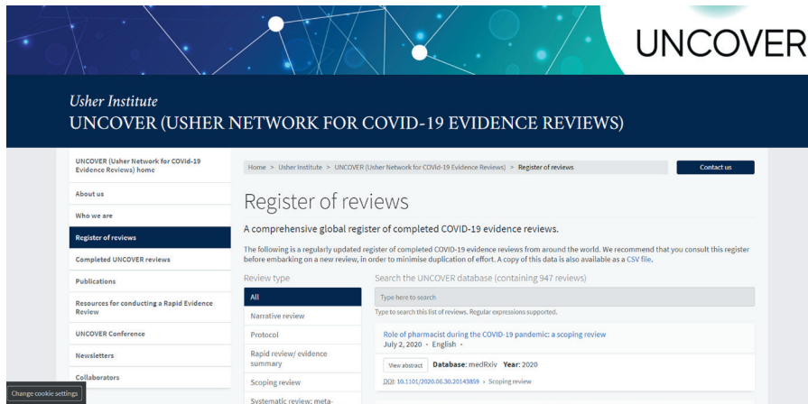
Photo: Register of reviews from UNCOVER team, the University of Edinburgh (from the author's own collection, used with permission).

ics has changed over time. Figure 2 , Panel B, shows that the proportion of reviews on clinical management of COVID-19 and pandemic-related health issues increased from April to September (from 60.3% to 82.3%) but the proportion has been steadily declining since September to 74.4% and 72.4% for October and November respectively. In contrast, the proportion of reviews on public health measures decreased from May to September except for August (from 21.4% to 10.5%) and the proportion was higher in October and November (16.8% and 13.9% respectively). For the other three topics, the trend is fluctuating. We further categorized the pandemic into three time periods: 1) before June 2020, where the main contributors were Western Pacific, Americas and Europe but the case incidence was kept in relatively low levels; 2) June-September 2020, where the number of new cases continued to increase and the main contributors were Americas and South-East Asia;