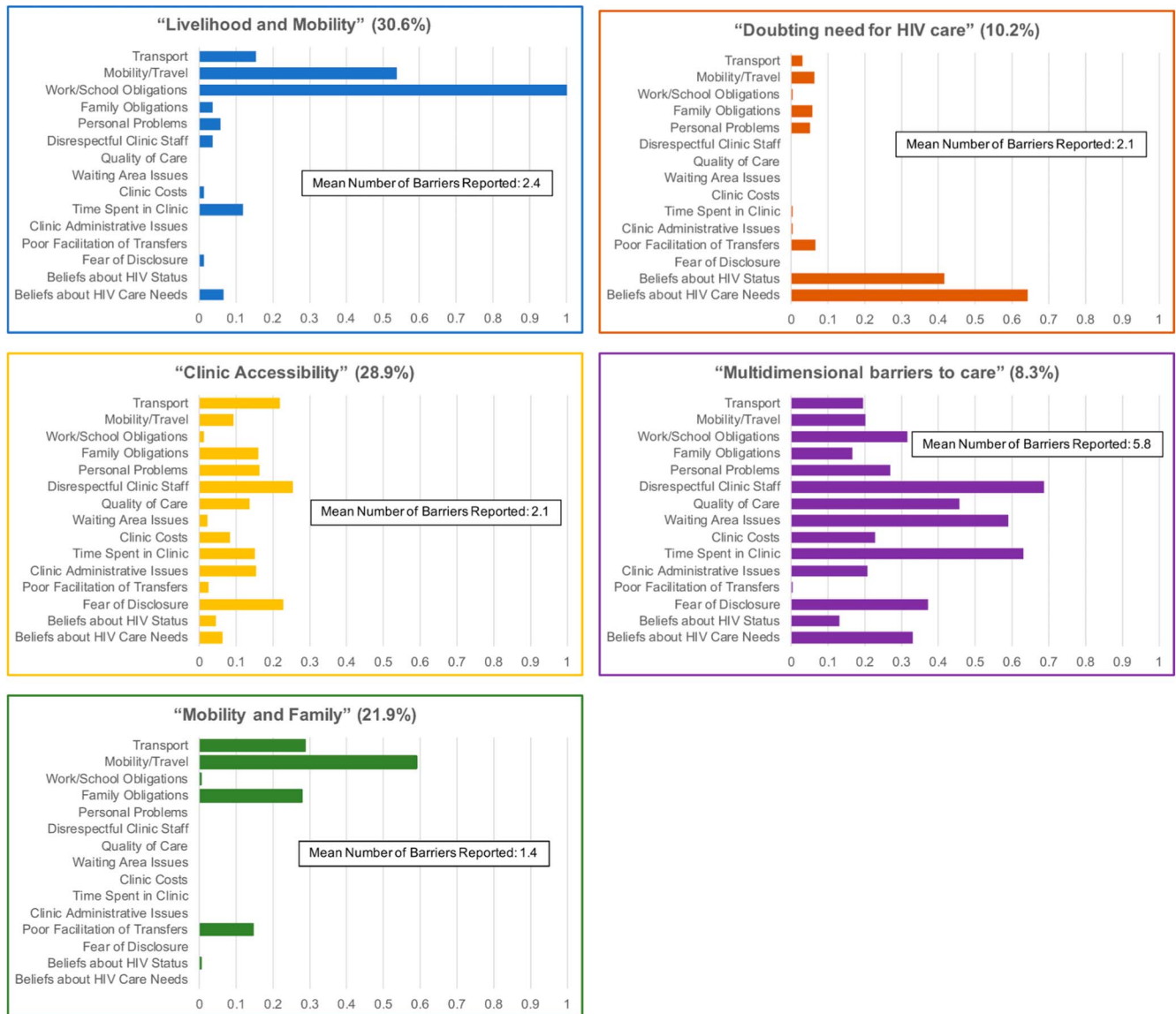
FIGURE 2. Profiles of care disruptions (n = 547). Patient profiles of care disruption are based on latent class models based on the patient-reported reasons for care disruptions and the number of reasons a patient reported. The estimated proportion of patients in each latent class are in parentheses at the top, and bars correspond to the probability of reporting a particular reason for care disruption within each class. Models used population-representative sampling weights after tracing a random sample of patients who were considered lost to follow-up as of July 31, 2015. full color online

We selected the model with 5 latent classes (ie, profiles of care disruptions) based on model fit and interpretability (Fig. 2). In this model, the first class were patients who reported predominately work/school obligations and mobility/travel challenges (mean 2.4 reasons) as reasons for their care disruptions (“Livelihood and Mobility” group) and accounted for 30.6% [95% confidence