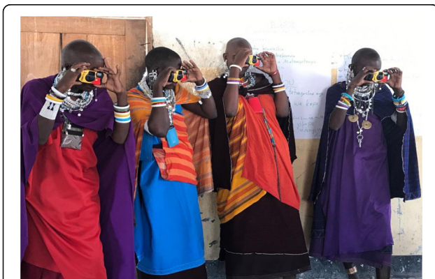
Fig. 2 Participants practicing use of disposable cameras

A week after the workshop, the research assistants and lead researcher again visited each woman to follow up on their progress as trachoma control ambassadors and to make sure they were comfortable using the cameras. Women were asked to return the cameras to the research team two weeks later on market day. All 20 cameras were returned. The cameras were sent for film development.