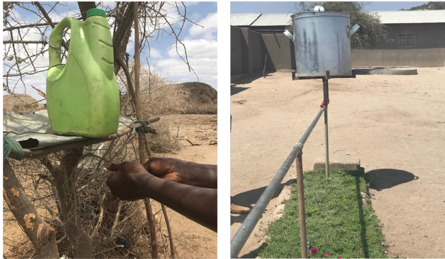
Fig. 3 'Leaky tins' installed at [1] a participant's boma, and [2] local primary school after the trachoma workshop

Photographic safaris are a source of income for Maasai where they often welcome tourists into their enkang for traditional dances and pose for photos on the side of roads. Despite the income generated, Maasai explained that photos taken by tourists is perceived as exploitation of their people. One elder discussed a recent incident in which tourists in Sinya, had photographed him while bathing in a dam. "Photography is an aggressive act, at least in the context of international tourism, where it is a means of dominating the object" [29, 30]. Participants were able to clarify the goals of the use of the cameras to many community members but some still did not understand nor trust the photographer's intentions and use of the photos. This was evident in some photos, that depicted people walking away, hiding their faces and, in once case, of a man waving a stick at the photographer. All women said they faced challenges related to the cameras but most felt confident their clarifications were well received. "There's always a few people that have doubts so its ok" [woman participant 6].