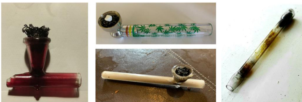
Figure 2. Glass pipes using stainless steel suspension devices, with crack and residue.

essential to maximise service engagement: pipe size and durability (small, strong and easy to conceal); provision of purpose fit gauze; good retention of crack residue (enabling reuse, see figure 2); familiarity and ease of use (does not require a change in smoking technique); and pleasure (does not diminish drug effect) (O’Heaire, 2013).