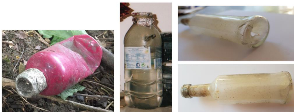
Figure 1. Makeshift pipes from bottles.

now so you can't do it because they realised why people were doing what they do, so create a hole in the bottom and then you get the mesh or the metal and you just burn it and then put it into the top and then you've got a pipe.