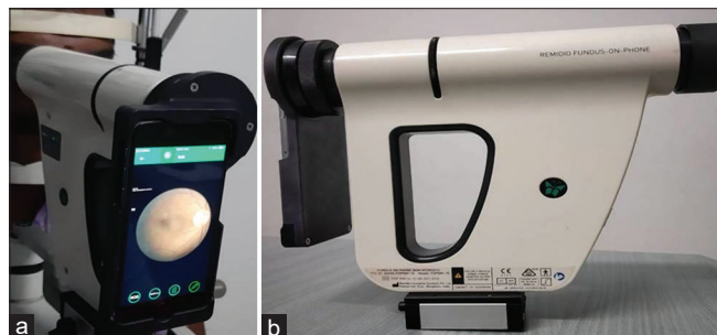
Figure 1: (a and b) Remedio fundus on phone nonmydriatic camera

to media opacities such as dense cataract or total vitreous hemorrhage); Grade 1-poor (only gross retinal changes detectable such as hemorrhages and dense hard exudates); Grade 2-satisfactory (major retinopathy details visible; minor degrees of retinopathy and subtle new vessels not clearly detectable); Grade 3-good (most of retinopathy changes clear and detectable); Grade 4-excellent (lesions clearly visible)