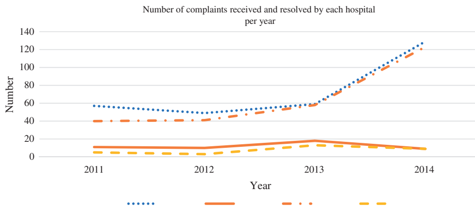
Figure 3. Complaints received and resolved at Tinyade and Chisomo hospitals by year.