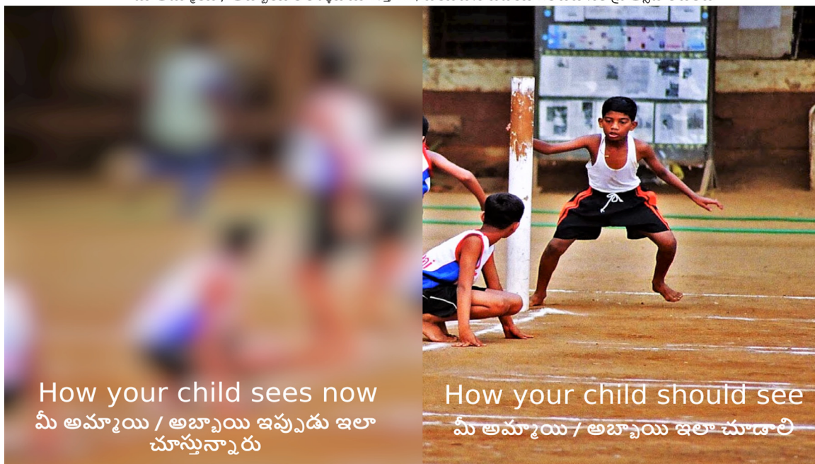
Fig. 2. Example of a PeekSim image – children playing 'kho-kho'.