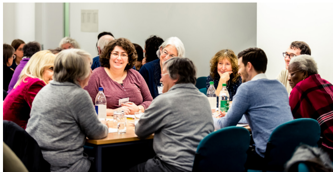
Figure 1 In the ‘Dragons’ Den’.

learnt, to help other researchers capitalise on the involvement of patients.