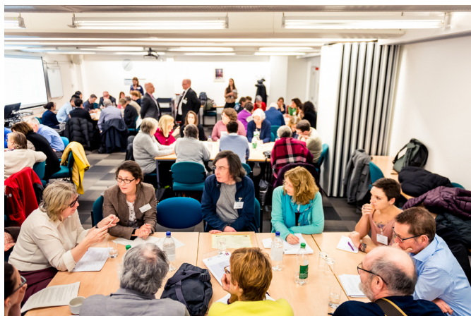
Figure 2 The Dragons’ Den session under way, showing the layout of the room used.

As epidemiologists, we try not to forget that each data point represents a person, but we need to re-examine whether we are asking the right questions of the