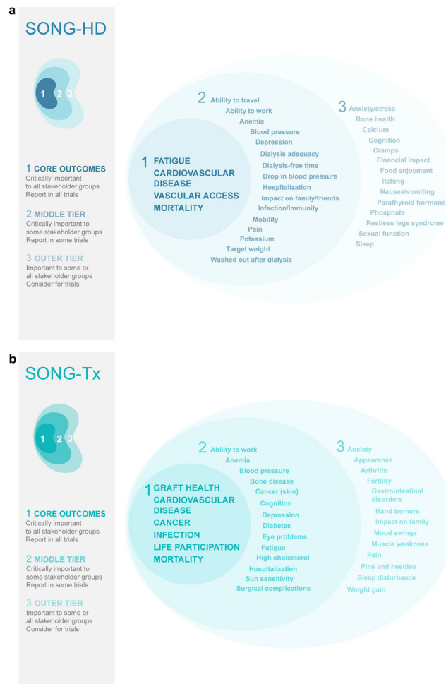
Figure 1 |. Core outcome sets for Standardized Outcomes in Nephrology (SONG). Outcome sets for (a) SONG-Hemodialysis (SONG-HD) and (b) SONG-Kidney Transplantation (SONG-Tx) are shown.