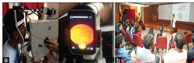
Figure 1: (a) Fundus photography for participants with type 1 diabetes. (b) Peer group support meets people with type 1 diabetes

Peer-to-peer support group meetings for people with T1D took place on the second Saturday of every alternate month at the main diabetic center, to create awareness about diabetes and DR, answer queries, and to provide support by means of group therapy. Some of the participants screened at the semi-urban