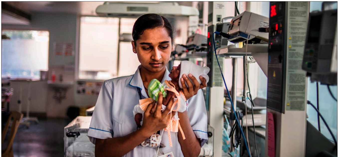
A nurse in the neonatal intensive care unit of Fernandez Hospital, Hyderabad, with a premature baby she has just fed.