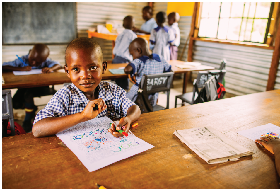
Figure 2. Supplementing nutrient-deficient diets with livestock-derived foods can have a wide range of health and social benefits.

Inadequate micronutrient intake during gestation has far-reaching adverse consequences through fetal programming (e.g., impaired growth of fetuses and infants and high risk of metabolic syndrome). Micronutrient supplementation can reduce the risk of being born with low birth weight but there is virtually no literature investigating the role of livestock product consumption relative to nutritional outcomes of pregnant women or their off-spring in Africa and South/Southeast Asia. Old studies conducted in Asia have reported direct effects of animal protein intake on milk output of breastfeeding women and infant breastmilk consumption. For example, a study in Burma (Khin-Maung-Naing and Tin-Tin-Oo, 1987)