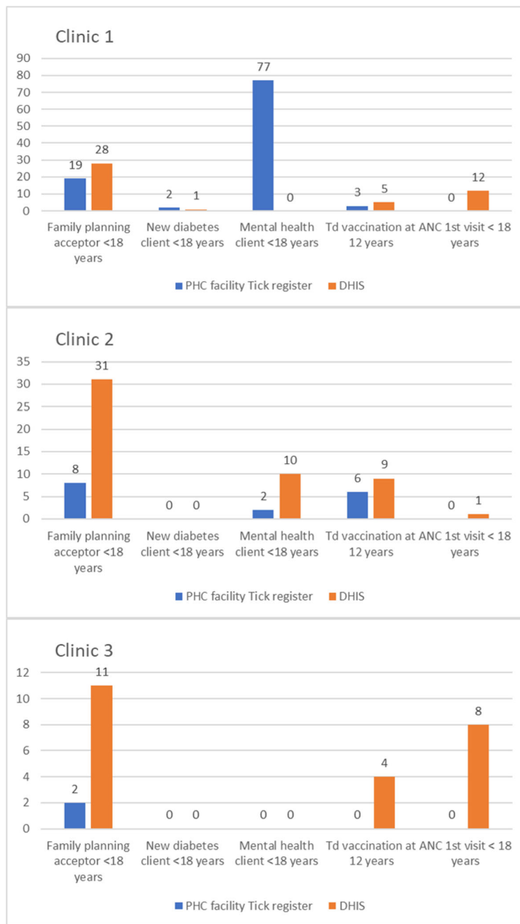
Fig. 3 Adolescent health indicators: PHCC comprehensive tick registers vs. DHIS data (three PHCC, May-Sept 2016)

specific indicators have been recommended for collection at PHC and hospital settings (Table 4, (25)). These indicators prioritise SRH and mental health, two of the most important causes of morbidity and mortality among YP [21].