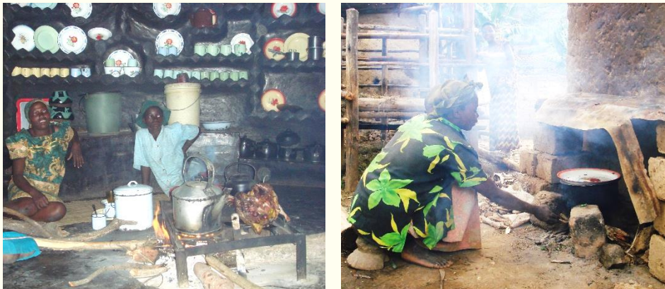
Figure 3: Left: A model CHC kitchen hut in Zimbabwe showing shelving made of clay, individual family utensils and covered drinking water with ladle. Right: In Rwanda, a traditional cooking shelter outside, with no CHC improvements.

Zimbabwean households usually have a dedicated kitchen with an open fireplace in the centre of the round thatched cooking hut. Seating for men is a moulded bench around the walls, whilst women and children sit on the ground by the fire, and chickens enter freely. The hut is usually very smoky causing a high rate of acute respiratory infections ( See Figure 2. ). Traditionally, cooking huts were highly decorated with built-in clay shelving in the walls and this practice has been reinvented by the CHCs with all members upgrading their kitchens in ever increasing levels of excellence.