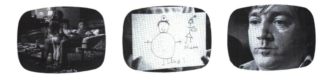
Figure 3: Stills from "Stop" television advertisement, 1988<sup>97</sup>

The advert was initially screened over the New Year period between 1988 and 1989, which was thought good timing, and not just for the festive season's apparently favourable advertising rates: 'a very appropriate time to advertise,