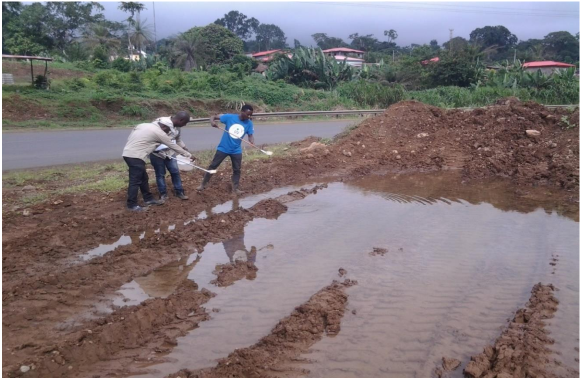
Fig. 4. Vehicle ruts with clean water that provides breeding sites for Anopheles larvae.