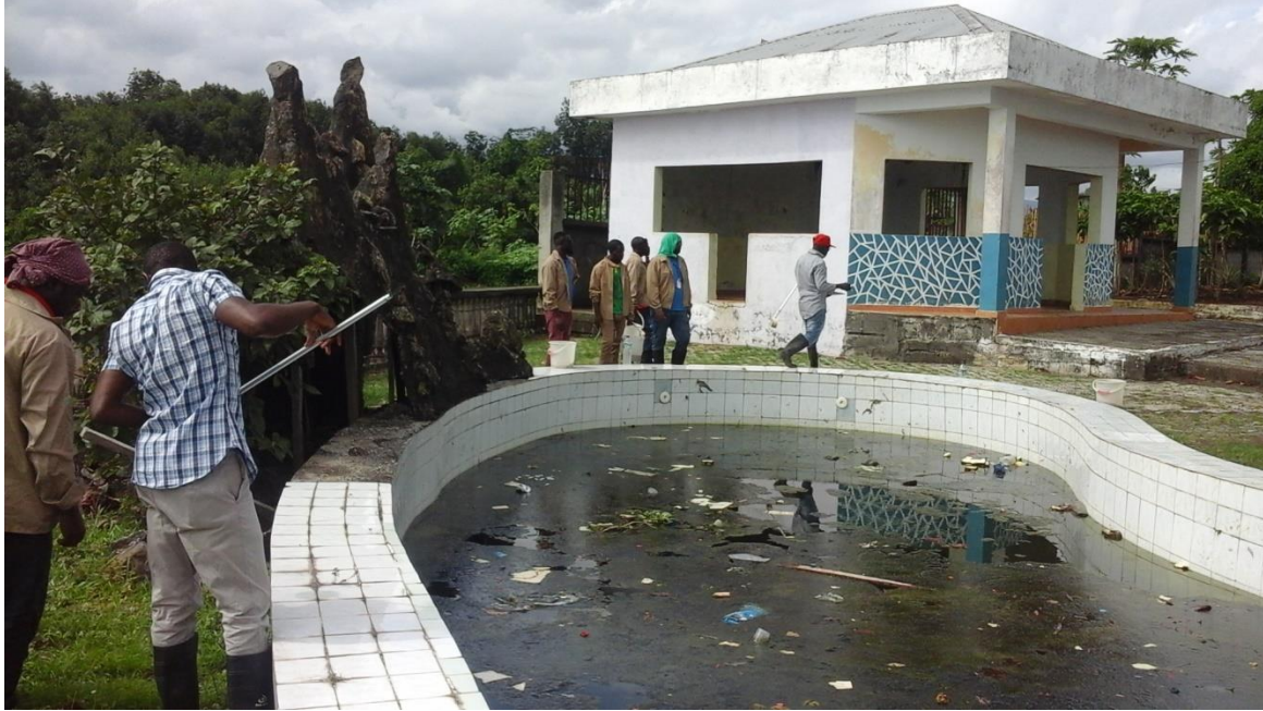
Fig. 3. Residual effectiveness of ACTELLIC 300cs organophosphate against mosquitoes from urban Malabo, Bioko Island.