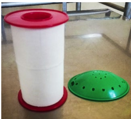
Figure 1 Rigid eye shield and tape