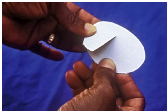
Figure 2 You can make your own eye shield using an oval piece of card