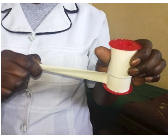
Figure 3 Cut an appropriate length of tape