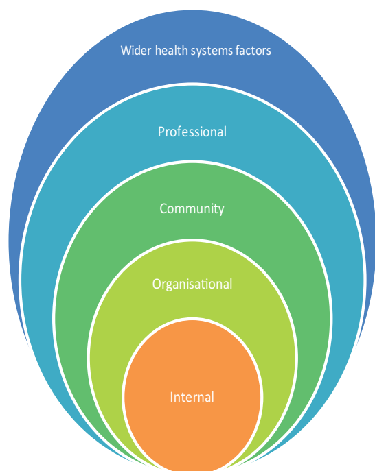
Figure 1. Adapted framework used to aid analysis. 25

this power differential, but reported seeking constructive relationships and aiming to set mutually acceptable targets. However, commissioners stressed they were accountable for public funds, and required providers to show continuous improvement by setting targets involving concrete changes in activity: 'Our focus is more on what are we getting for our money' (Commissioner, Site 4).