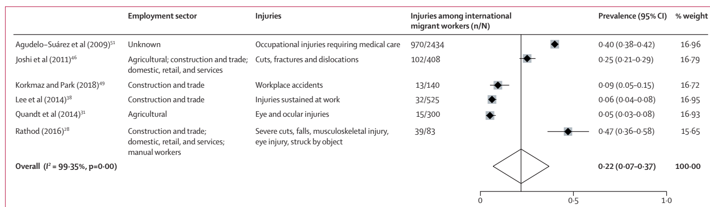
Figure 3: Forest plot of prevalence of having at least one occupational accident or injury among international migrant workers

studies included musculoskeletal pain, 41,43,54 work-related stress, and self-reported health and wellbeing. 45