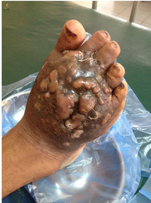
Fig 4. Right foot after 14 days of treatment with amikacin and trimethoprim-sulfamethoxazole. Sinuses were closed and no more discharge observed.