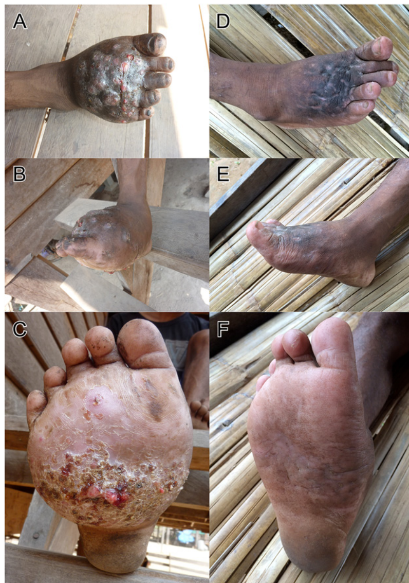
Fig 1. Pictures A, B and C show the right foot before treatment, Pictures D, E and F show the foot 22 weeks after treatment.

The patient was afebrile with normal vital signs and physical examination was unremarkable except for a massive tumour-like lesion of the right foot with multiple sinuses on the dorsal and plantar surfaces (Fig 1A, 1B, and 1C).