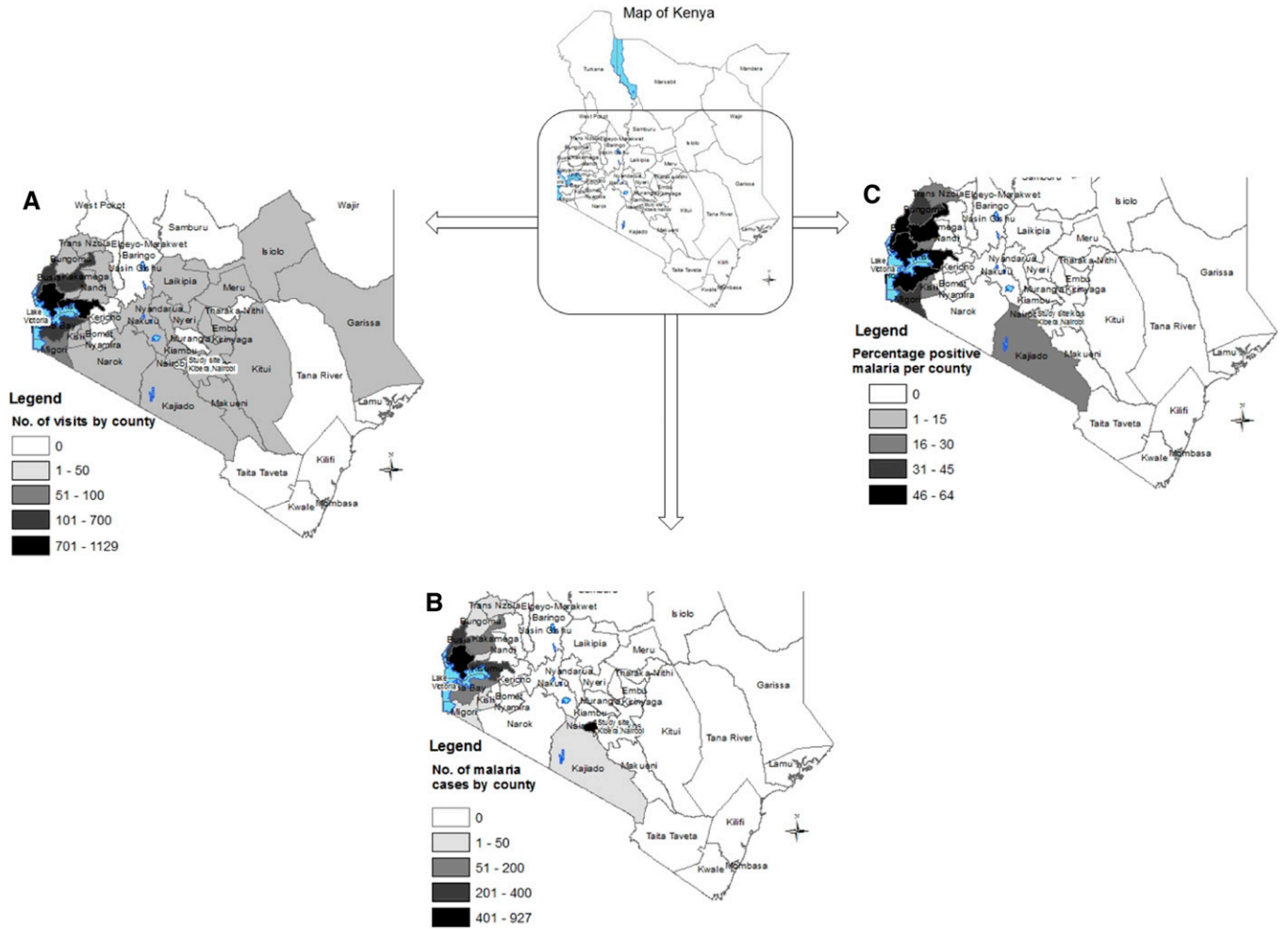
FIGURE 1. (A) Number of visits, (B) distribution of malaria cases, and (C) percent positive malaria cases by county among patients seen in Kibera clinic, Nairobi, Kenya, from January 1, 2007 to December 31, 2011.

demonstrated evidence of the mosquito vector Anopheles gambiae s.l. breeding in polluted water pools. 24 However, An. gambiae s.l. mosquitos represented only 0.05% of the almost 177,000 mosquitos captured and speciated, and none of the mosquitos were found to be positive for Plasmodium sporozoites. 24 Although not evaluated in this study, climatic