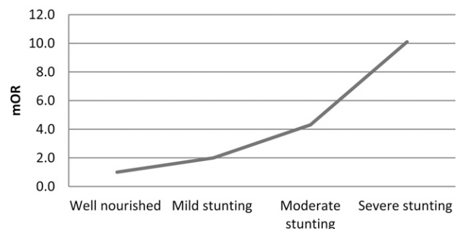
FIGURE 2. Interaction of moderate-to-severe diarrhea due to Aeromonas with nutritional status (height-for-age Z score) in children aged 24–59 months in Pakistan.