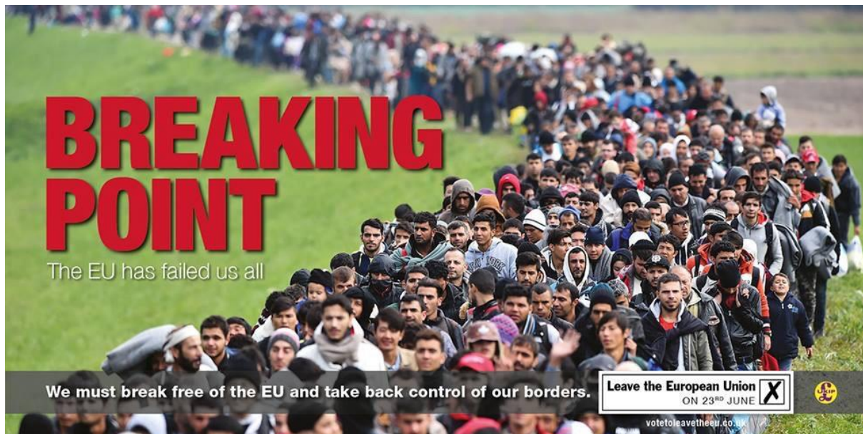
Figure 1: 'Breaking Point' Poster - Family Advertising Ltd (2016) for the United Kingdom Independence Party

** Manchester Business School, University of Manchester, Manchester colin.lorne@manchester.ac.uk