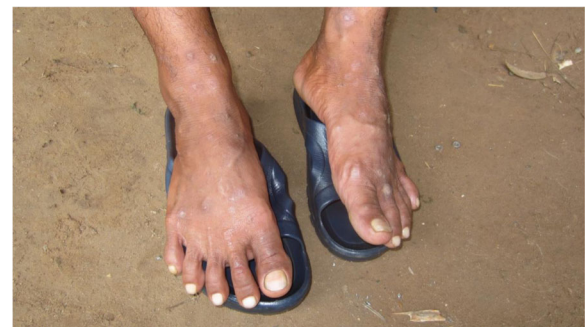
Fig. 6 Cercarial dermatitis

There are several limitations to this study. Firstly, the translation of the DLQI/CDLQI into Lao was only