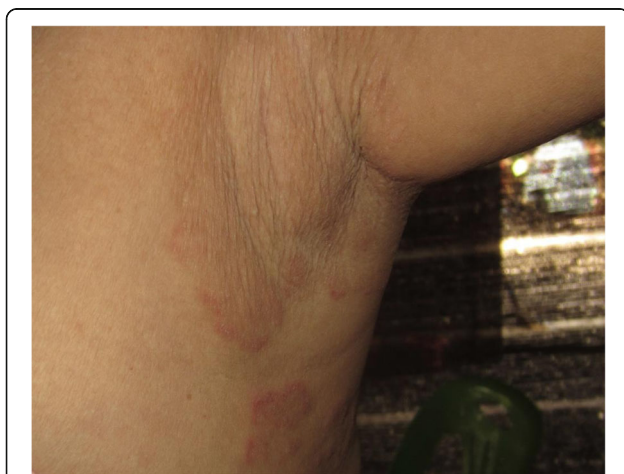
Fig. 1 Dermatophyte infection in the axilla

The aim of this study was to assess skin disease prevalence in a rural Lao population. We have documented the skin diseases found in a rural Lao population and made an assessment of the resulting impact on quality of life. It is important to note however that this study used participants from only one village and as a result, while the findings shine light on the more common skin