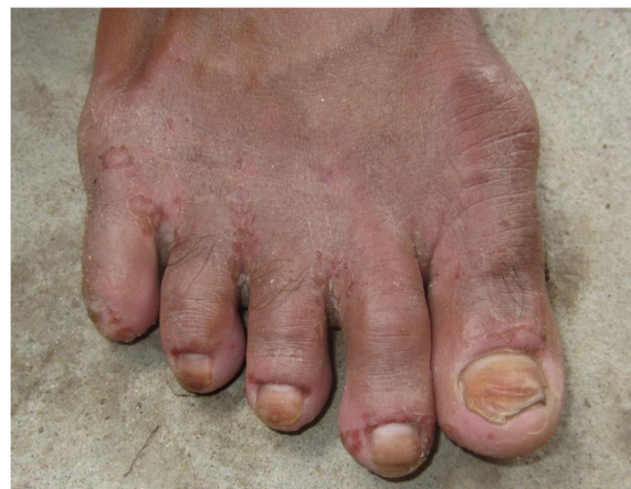
Fig. 2 Immersion dermatitis

diseases in these communities, the data does not allow for an estimation of the overall prevalence of skin disease in rural Laos.