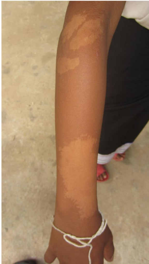
Fig. 5 Pityriasis alba

Two studies report on the prevalence of eczema in schoolchildren in the Lao capital, Vientiane [18, 19]. Both studies used the ISAAC questionnaire to determine the prevalence of asthma, rhinitis and eczema and but no skin examination was performed. The studies asked schoolchildren aged 13–14 years and the parents of schoolchildren aged 6–7 years to complete the questionnaire. The prevalence of eczema was reported as 7.1% in Kuroiwa et al.'s study and 11.8% in Phathamavong et al.'s study which was performed 8 years later in 2006. Only 3% (3 participants) of our school aged cohort were found to have evidence of eczema on examination. This discrepancy may be due to several factors: firstly our cohort were from a rural area, rather than the urban location used in the two previous studies. Secondly, in our study the diagnosis of eczema was based on skin examination rather than a questionnaire-based diagnosis used in the two ISAAC questionnaire studies (an itchy rash coming and going for at least 6 months). Finally,