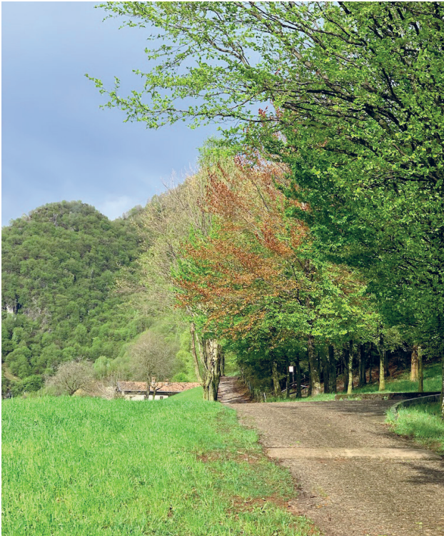
Photo: The road towards a value-based approach to global health (from the collection of Ben Cislighi, used with permission).