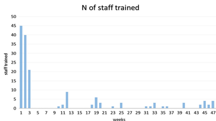
Fig. 1 The number of staff trained over one year

Ward managers in wards 2 & 3 initially perceived grip strength measurement as unsuitable for older inpatients