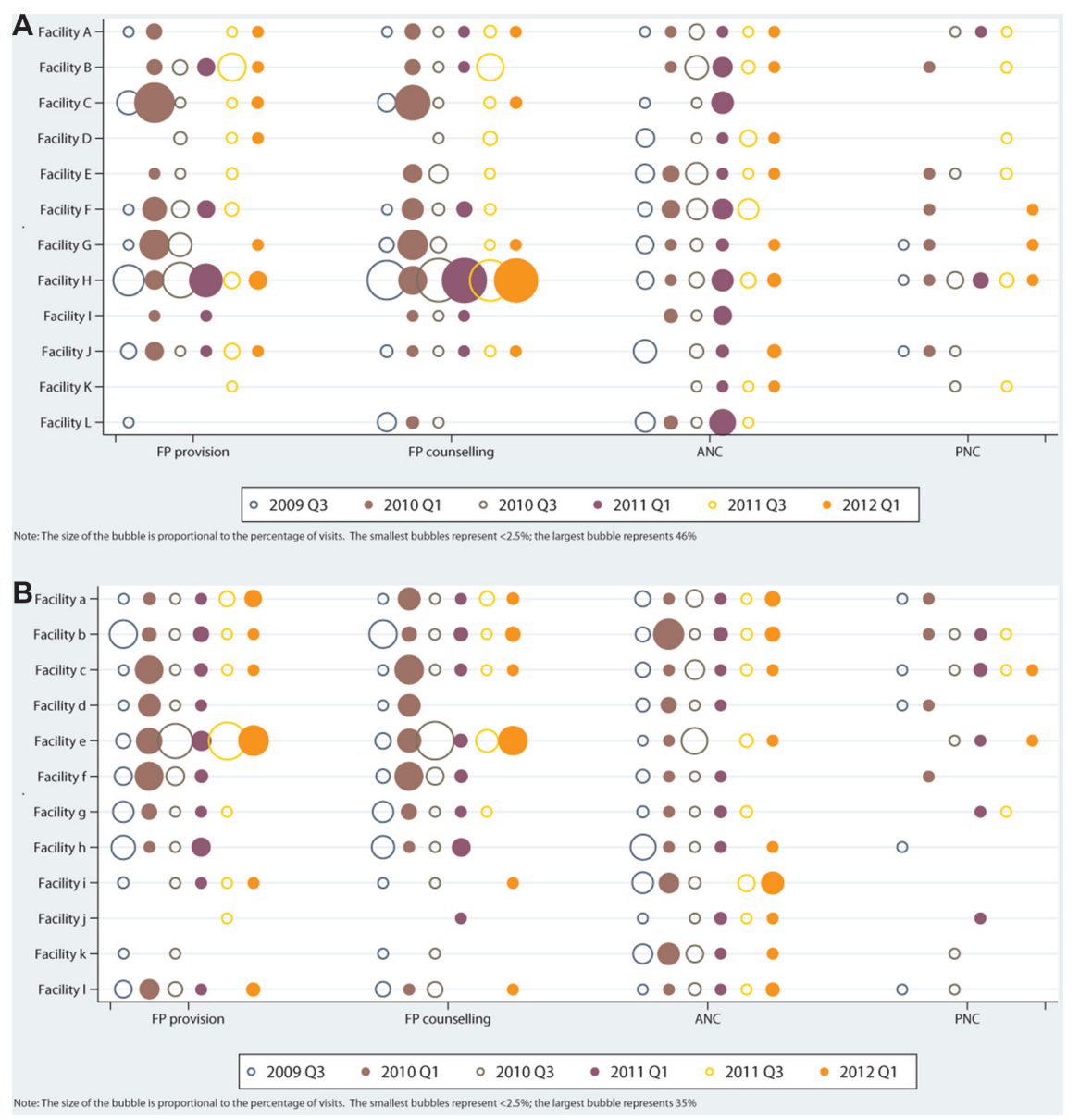
Figure 3 Proportion of RH visits in which an HIV/STI service was also received, by facility, RH service and round for HIV-PNC integration model (A) and HIV-FP model (B). ANC, antenatal care; FP, family planning; PNC, postnatal care; RH, reproductive health; STI, sexually transmitted infection.

continued funding and prioritisation as with PMTCT which has attracted substantial and sustained funding from large donors as part of the fight against HIV transmission to children. For routine testing in FP services, the supply of HIV testing kits, without which providers are unable to provide testing services and are less likely to offer HIV counselling, is also important. Related qualitative work also highlights the importance of providers. Provider commitment was challenged by staffing shortages, rotations and turnovers and increased workload. The importance of supervisory support, teamwork, staff being able to make flexible decisions and good communications between providers and across clinics within facilities—in the delivery of integrated care—has been observed in related publications.