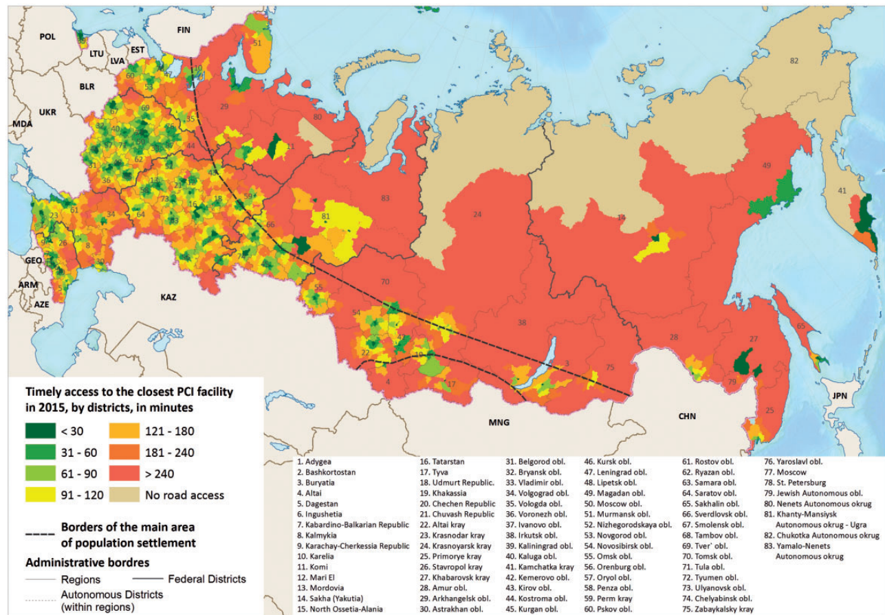
Figure 2. Driving times to the closest PCI facility in Russia in 2015.

The results shown so far have estimated travel times to the nearest PCI facility regardless of which region it was in. However, the financing and delivery of health care are largely devolved to the regions, so patients will normally be treated in the region in which they reside. For some people, the obligation to be treated in their home region might increase travel times compared with going to a facility that is closer but in another region. Consequently, we undertook a sensitivity analysis to compare differences in travel times to the nearest PCI facility in the same region or to the nearest facility wherever it is. This showed that, in 2015, 7 441 200 people or 11% of the population aged 40+ years lived in 400 bordering districts where it would be faster to go to neighbouring regions for treatment. For another 231 500 people who lived in 15 districts, PCI facilities are located only in neighbouring regions (Supplementary Figure 3, available as Supplementary data at IJE online). However, this option is associated with a relatively small increase of about 0.5% (337 690 people) in those who would live within 60 minutes' travel time and 2.3% (1 456 130 people) within 120 minutes' travel time.