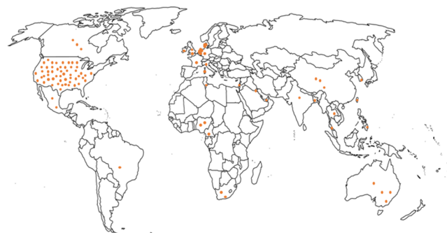
Fig 3. Geographical distribution of included studies.

Among the 56 studies assessed as observational study designs, 19 were cross-sectional, of which seven had high risk of bias [52–58], four had a moderate risk of bias [59–62] and eight had low risk of bias [63–70]. 15 were cohort studies; one study had a high risk of bias [71], five had a medium risk of bias [72–77], and eight had low risk of bias [78–85]. One study used a case-control study design and had a moderate risk of bias [86]. 14 were pre-post studies; one had a high risk of bias [87], 11 had medium risk of bias [88–98], and two had low risk of bias