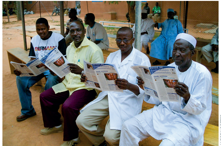
Taking time to read the Community Eye Health Journal . NIGER

Thirty years and 100 issues call for celebration and reflection. In this article, the editors and the journal team do both, while the current editor considers the impact the Community Eye Health Journal has on its readers and the patients they serve.