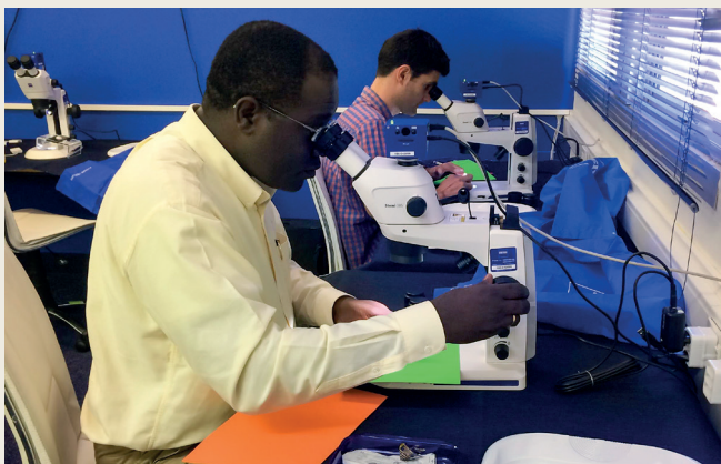
Surgeons practise techniques again and again. SOUTH AFRICA

Although it takes years of experience and practice in the operating theatre to become an expert cataract surgeon, learning cataract surgery to an acceptable level of competence can be achieved safely and efficiently thanks to cataract training by simulation.