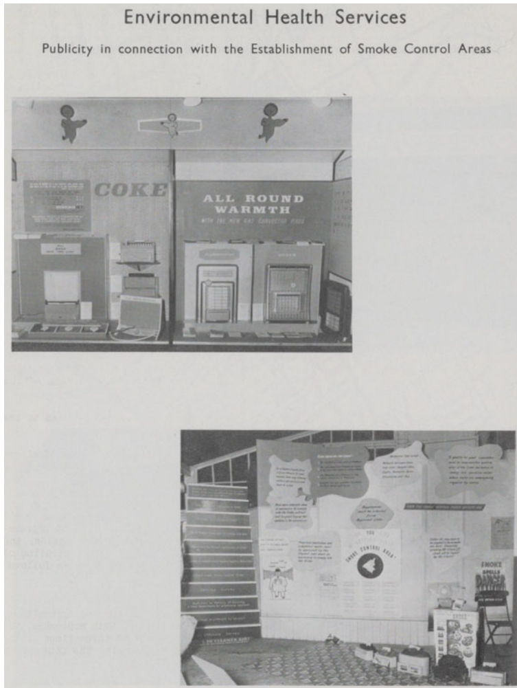
Figure 7: Photographs of exhibition on air pollution and smokeless fuels organised by MOH for Leyton, 1961. Source: Report of the Medical Officer of Health for Leyton, 1961, 20. Permission: Licenced under Creative Commons Attribution 4.0 International Licence

Often aimed at young people, these exhibitions told visitors about the services provided by their local health department. Health citizenship was not, however, just about rights, but also involved responsibilities. These included making prudent and effective use of health services, but, as health became linked to behaviour, also embraced a duty to remain well. 59