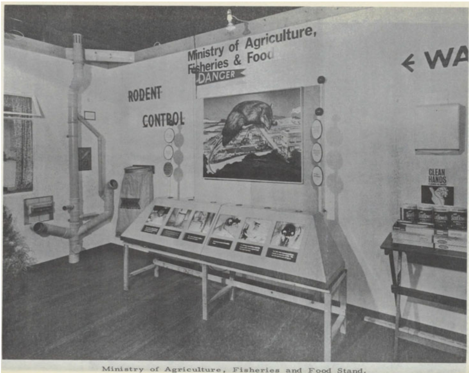
Figure 5: Photograph of exhibition organised by MOH for Hampstead, 1962, with a prominent image of a rat. Source: Report of the Medical Office of Health for Hampstead, 1962. No page number. Permission: Licenced under Creative Commons Attribution 4.0 International Licence.

Yet, food hygiene was not the only existing danger to public health that assumed new importance in the post-war era. The environment had long been thought to pose a threat to