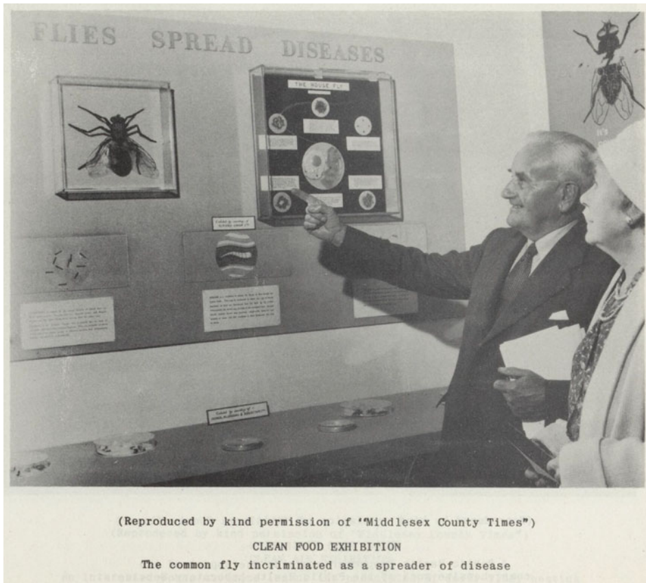
Figure 6: Photograph of exhibition organised by MOH for Ealing, 1961: The common fly as a spreader of disease. Source: Report of the Medical Office of Health for Ealing, 1961. No page number. Permission: Licenced under Creative Commons Attribution 4.0 International Licence.

health. The introduction of sewers, clean water and drainage during the nineteenth century resulted in the removal of one kind of environmental cause of ill-health, but air pollution was still a concern. Following the Great Smog in 1952, the Clean Air Act was introduced in 1956. The Act required those living in smoke control areas (which included all of London) to burn smokeless fuels in their homes. 49 MOsH exhibitions after 1956 often dealt with the issue of clean air, sometimes collaborating with utility providers and commercial enterprises to demonstrate the use of smokeless fuels and appliances (Figure 7). Indeed, the MOsH appeared to have been increasingly concerned with what went on in homes, and not just in relation to food hygiene in kitchens, or the burning of smokeless fuels in living rooms. Safety in the home, and the prevention of domestic accidents was an increasingly common theme of exhibitions during the mid-1950s and early 1960s. Some MOsH went to considerable effort to get the message across. In 1951 the MOH for Woolwich exhibited