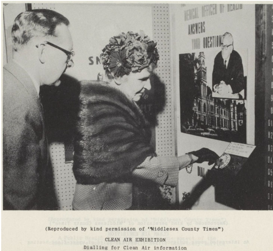
Figure 8: Photograph of automatic question and answer device used in exhibition organised by MOH for Ealing, 1961. Report of the Medical Officer of Health for Ealing. Permission: Licenced under Creative Commons Attribution 4.0 International Licence.

have singularly little effect upon the public'. 113 In contrast, television programmes were regarded by survey respondents as the most effective form of health education, followed by films, talks in schools, and radio programmes. This led Chalke to conclude that 'it would seem that since the public are responsive to instruction by television, health magazines, and modern commercial advertising, a great deal more use should be made of them'. In particular, 'The popularity of television as a health educational medium cannot be overlooked; it must surely serve as a guide to future activities in health promotion.' 114